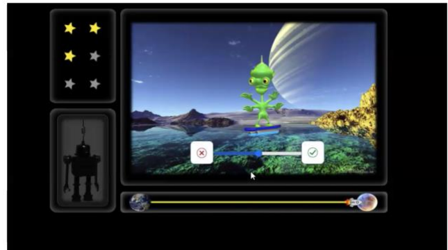
Figure 2: Screenshot of the test phase.

exposure phase, using the same slider scale that they used in the practice trials. The 1-level sentences and 2-level sentences were presented in different blocks, with the 1-level sentences presented first. The level 2 instructions were modified slightly, to acknowledge that they would be longer: “Now Zooma will say sentences in Zilly that are longer. Some will be good. Some will be bad. Again, your job is to decide how well Zooma is speaking Zilly.” A screenshot of the test phase is shown in Figure 2.