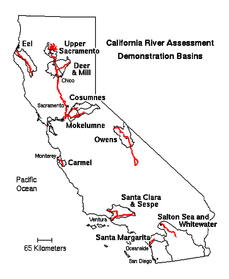
Figure 1: CARA Demonstration Basins

bibliographic information from non-electronic forms. Phase II is scheduled to be completed in December 1995. Later phases are planned to expand the database to include the entire state.