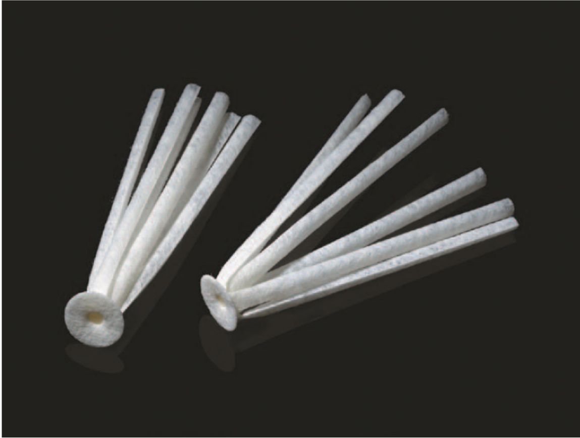
Figure 1. Synthetic bioabsorbable anal fistula plug. The disk and tubes are both made of the copolymer polyglycolic acid:trimethylene carbonate. At implantation, the plug is tailored to fit and fill the specific fistula by removing one or more of the tubes. After the plug has been inserted into the fistula tract, the remaining tubes are trimmed flush with the skin.

The fistula tract was debrided by using a curette, gauze, or brush and irrigated with peroxide or saline. At plug insertion, as many tubes as necessary were cut off, although an effort was made to retain the maximum number possible to ensure that the fistula tract was snugly filled. The disk portion of the device was not trimmed. The disk was sutured to the anorectal wall by using at least 3 sutures (1 placed cranially and 1 placed on each side) of 2-0 Vicryl on a UR6 or SH needle (Ethicon, Somerville, NJ). Disks were neither covered with tissue nor buried in a tissue pocket. The ends of the retained tubes were trimmed flush with the skin. No sutures were placed in the external opening, which was left sufficiently open to allow drainage.