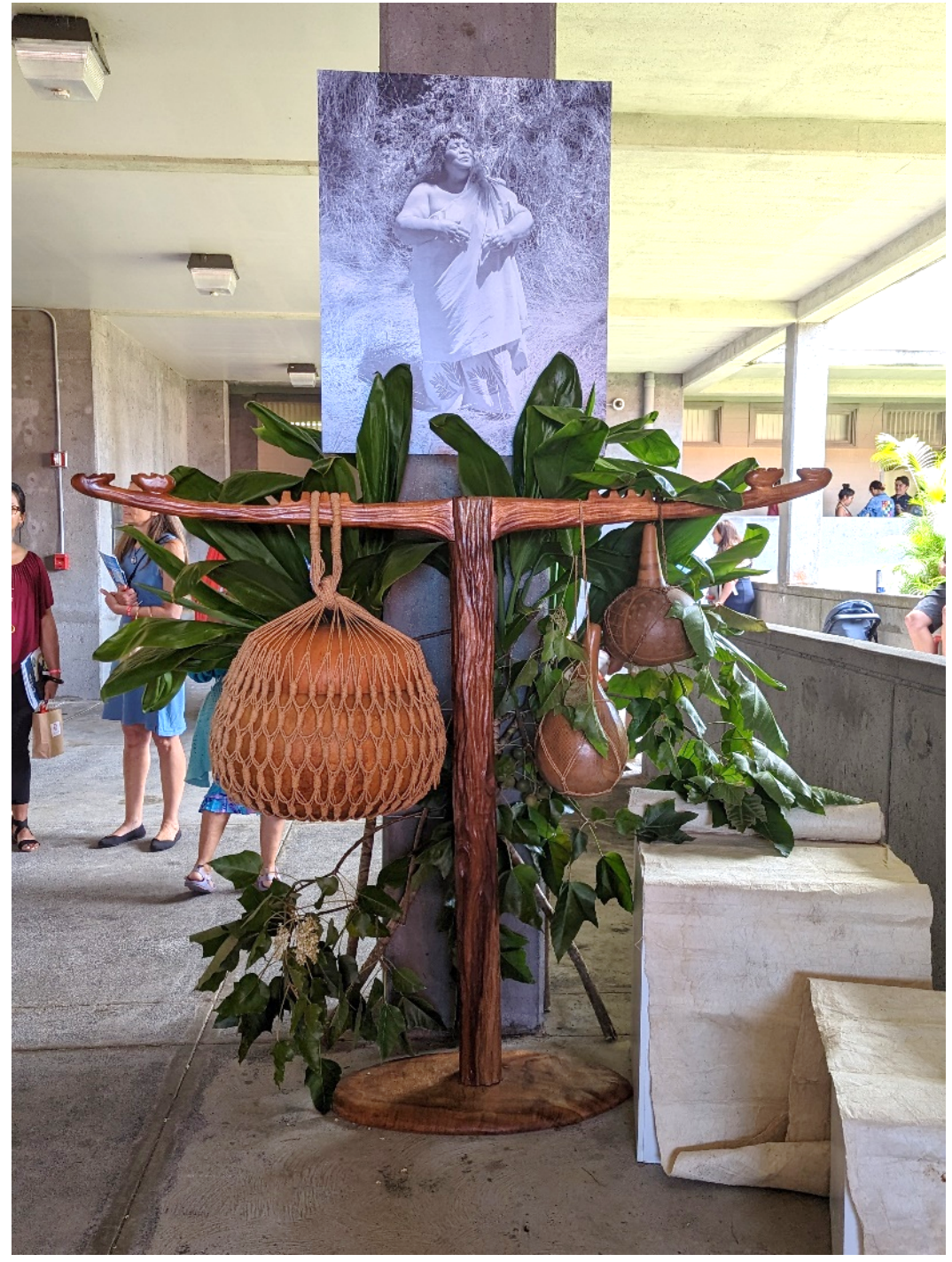
Figure 7. Place for ho'okupu (offerings), featuring a photograph of Aunty Edith by Franco Salmoiraghi, Edith Kanaka'ole Hall, University of Hawai'i at Hilo, May 6, 2023. Photograph courtesy of the author