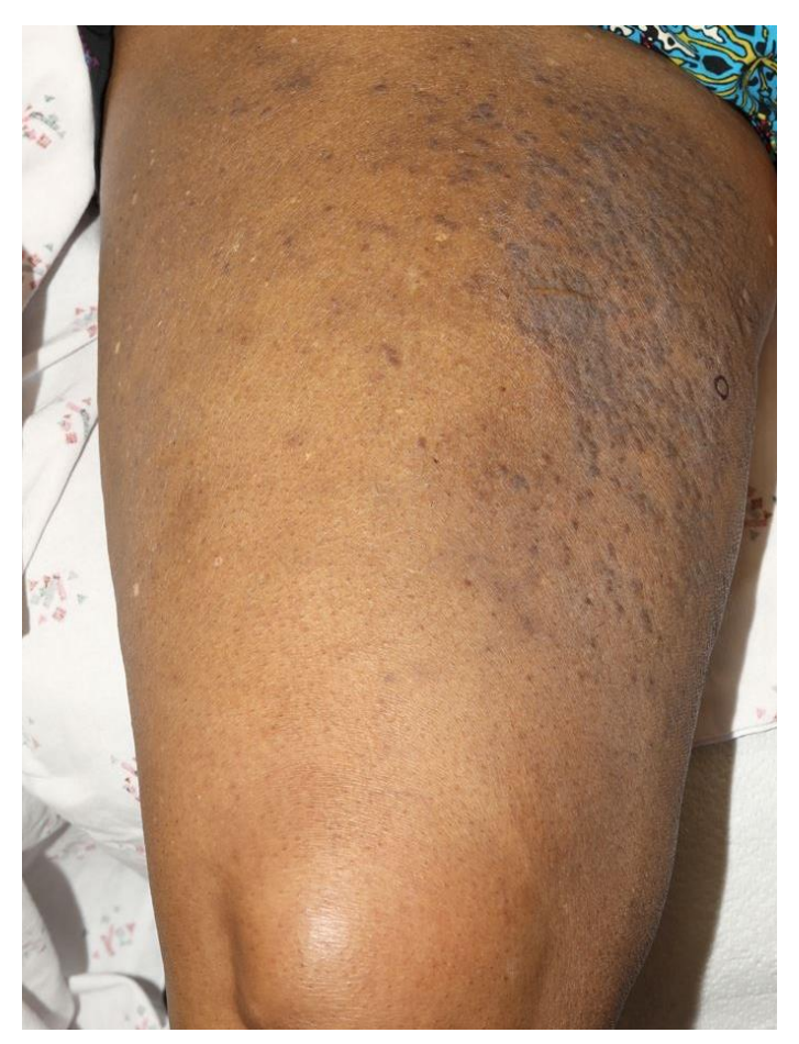
Figure 1 . Lymphangioendothelioma. Multiple, grouped 2-4mm hyperpigmented papules coalescing into a plaque on the patients' anteromedial right thigh.