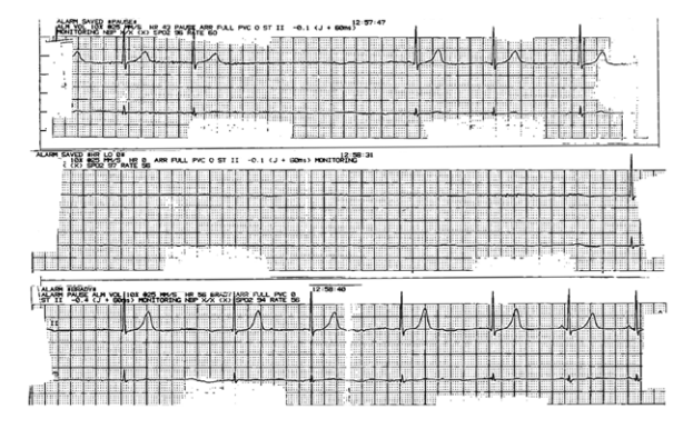
Fig. 3 Telemetry recording shows repeated ictal asystole.