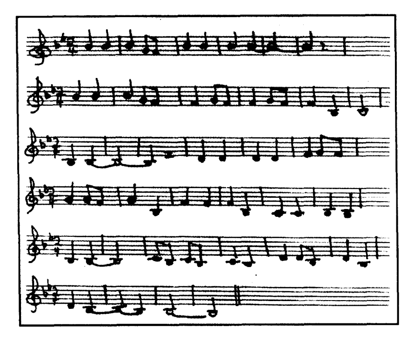
FIG. 4. "CHARLIE BROWN" IN WESTERN NOTATION

To be sure, Western notation has its place in certain kinds of ethnography, but that place is not part of the sound world that includes "Charlie Brown." Western notation, which focuses solely on representing and translating sound , overlooks communicative context. Charlie Brown's fullest meanings material-