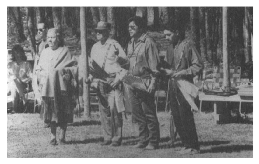
FIG. 1. GOURD DANCERS

The Gourd Dance is a simple dance. Its attire is simple. Men most often wear jeans or slacks, a nice shirt, moccasins or cowboy boots or sneakers, and silver and bead bandoliers. They wear cloth sashes (many made of velvet) wrapped around their waists and knotted on the right; the ends—which hang past the knees—are beaded and fringed with polyester chainette. In their hands they carry feather fans and rattles made, for the most part, of tin. Sometimes they wear a Gourd Dance blanket—half red, half blue—draped over the shoulders and hanging to the knees or draped across the chest. Women dancers often wear fringed shawls over street clothes. Sometimes they wear more formal dance attire (figure 1).