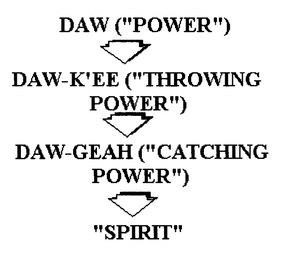
FIG. 5. SPIRIT