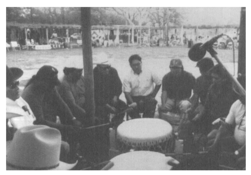
FIG. 3. SINGERS