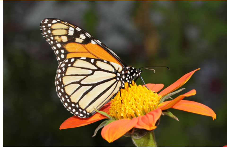
Figure 4. Monarch butterfly ( Danaus plexippus ) visiting a Tithonia rotundifolia flower.

These gorgeous, often colorful, daytime-flying insects have long been purposely lured to flowers by gardeners. Butterfly larvae, or caterpillars, require specific plants to feed on, though the adults can use nectar from many plants. While adult butterflies are not as efficient pollinators as are bees, they do transfer pollen that sticks to their legs as they flit from flower to flower. Their stunning looks have made them attractions at many botanical gardens and zoos, where butterfly houses and gardens stock their favorite flowers for nectar resources (figs. 4 and 5) (Stewart 1997; Xerces and Smithsonian 1998).