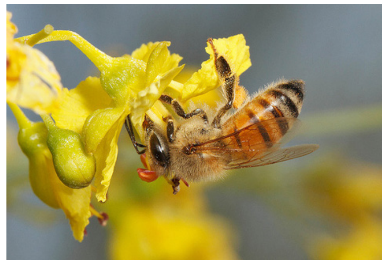
Figure 2. Honey bee ( Apis mellifera ), visiting Parkinsonia sp.

Bees are the most important biotic agent for the pollination of agricultural crops, horticultural plants, and wildflowers (Frankie and Thorp 2002; NAS 2007). People are often most familiar with the introduced European honey bee ( Apis mellifera ), which was brought to the eastern United States 400 years ago; it arrived in California around 1850. The honey bee is just one species of bee in this incredibly diverse group of pollinators. Approximately 4,000 species of bees exist in the United States, with 1,600 of those residing in California (figs. 1 and 2). About 20,000 species have been recorded worldwide (DiscoverLife.org). Native bee species come in a variety of shapes, colors, sizes, and lifestyles that enable them to pollinate a diversity of plant species (see also Griffin 1997).