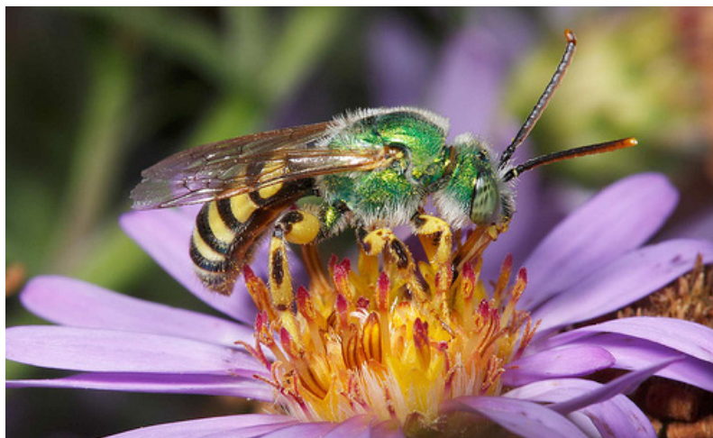
Figure 1. Male of Agapostemon texanus visiting Aster sp.

The relationships that exist between flowering plants and pollinators are not casual, as many plants and pollinators have coevolved over long periods of time to efficiently exchange services. Pollination of flowers by pollinators is the unintended outcome of their activity on the flower. As pollinators visit flowers to sip nectar