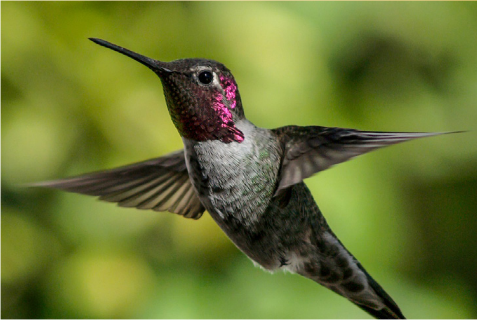
Figure 3. Male Anna hummingbird ( Calypte anna ) hovering and showing its characteristic iridescent rose color on its head and throat.