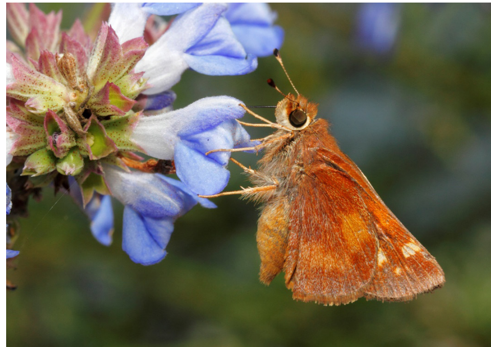
Figure 5. An umber skipper ( Poanes melane ) visiting a Salvia uliginosa flower.