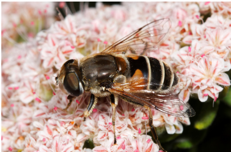
Figure 6. The common hover fly ( Eristalis arbustorum ) visiting Eriogonum .

The importance of conserving a diversity of pollinators has become more apparent as the introduced European honey bee population has declined due to colony collapse disorder (CCD). Unique to honey bee colonies, CCD causes worker bees to suddenly and mysteriously disappear. Single hive losses ranging from 30 to 100 percent have been reported by beekeepers in both North America and Europe (Nordhaus 2011). Honey bees are relatively inexpensive, and the industry standard when experiencing large hive losses is to order additional hives. A growing concern, however, is that if hive losses continue to increase, demand for honey bees will become too great to sustain. What will not decrease is flowering plants' need for successful pollination from their associated pollinator(s). While scientists still do not know the exact cause(s) of CCD, they do know that managed honey bees are subjected to a number of stressors, such as pesticide poisoning, low food-source