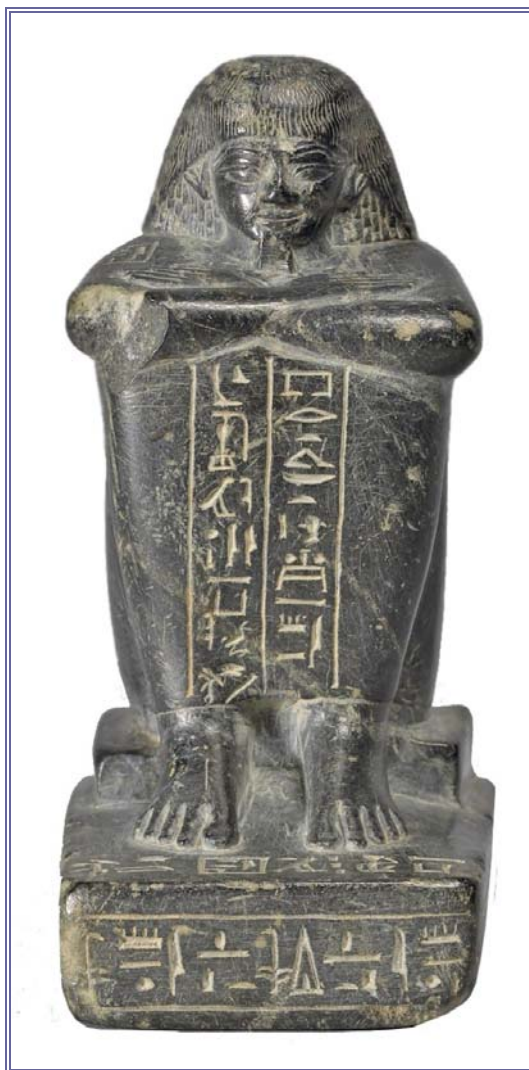
Figure 1. Statuette of Khaemwaset. Black serpentine, h. 86 mm.

are very similar and may have belonged to a Ramesside statue group of a man and a woman that has lost its shared base (Schulz 1992: 779 – 780).