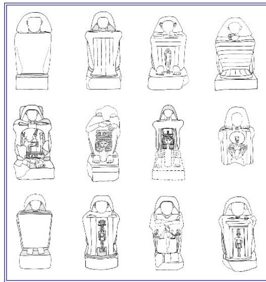
Figure 3. Varieties of block statue types.

type featured Senenmut and the young princess Neferura enveloped together in the same cloak (e.g., see Cairo, Egyptian Museum JE 37438 ). From the 18 th -Dynasty reign of Amenhotep III to the 19 th Dynasty, the statue type was modified and enriched by variations of costumes, wigs, and jewelry (e.g., Florence, Museo Archeologico 1790; Schulz 1992: 150 – 151, no. 69; and see Leiden, Rijksmuseum van Oudheden AST 22 ; Schulz 1992: 350, no. 200). Additional elements became particularly common in the Ramesside Period, such as stelae (e.g., Cairo, Egyptian Museum JE 33263; Schulz 1992: 282, no. 155), divine figures (e.g., see Memphis, Art Museum of the