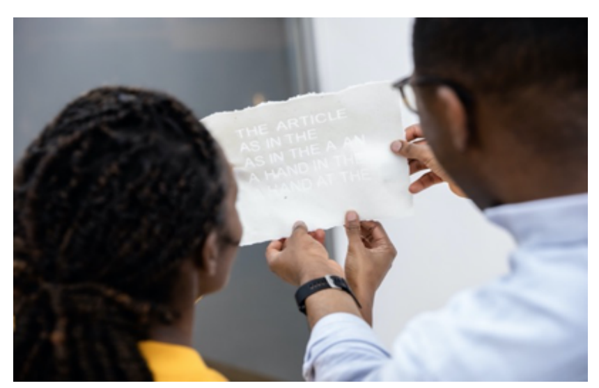
Figure 3 Sayward Schoonmaker, Authoritative Forms, 2019–20.

When the sheet is dry, the pattern is visible when held up to light (fig. 3) or by reflected light when the paper is backed by a darker surface (fig. 4). Because the watermark is made during the wet stage of forming a sheet, when the fibers are not yet cohered, the pattern/mark/word is inextricable from the paper's material body. A watermark cannot be made or reproduced on an already formed sheet of paper; it is not a mark made on the paper but in the paper. The mark is the paper itself.