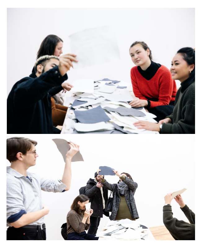
Figure 8 (top) Sayward Schoonmaker, Authoritative Forms, 2019–20. Figure 9 (bottom) Sayward Schoonmaker, Authoritative Forms, 2019–20.

constitute fragmentary thoughts, an inside voice searching, calling, and asking for a foothold in form. That is to say, the voice asks what in the material world is bounded and therefore is formed. How you read is an invitation to play. The papers are unbound, awaiting order and disorder; they do not demand a sequence. With time and hands and people, the tidy trail becomes a disheveled pile, a beautiful tatter of matter, a conversation among those at the table floats over the papers (figs. 8–9). For a time, the table gains the intimacy of a dinner table, the papers become the cups and dishes, handled with intention and sometimes completely ignored, and then absent-mindedly fondled while talking, as if your hands are working up a thought, forming it to pass through your lips.