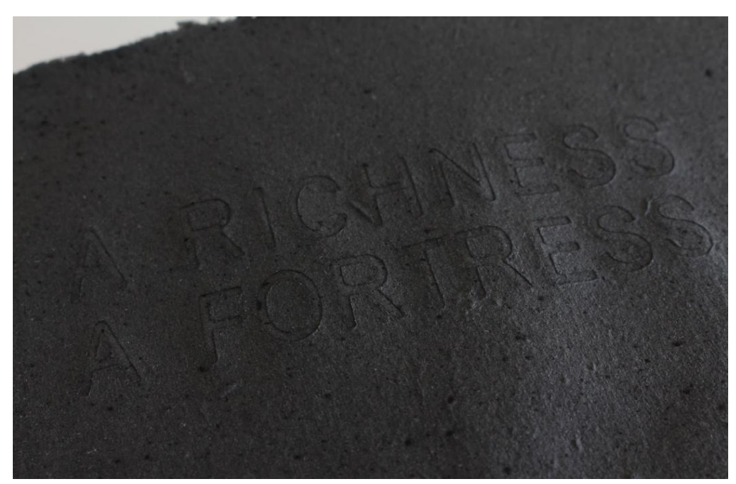
Figure 7 Sayward Schoonmaker, Authoritative Forms, 2019-20.

In participating, in playing along, viewers unmake the work's uniformity: