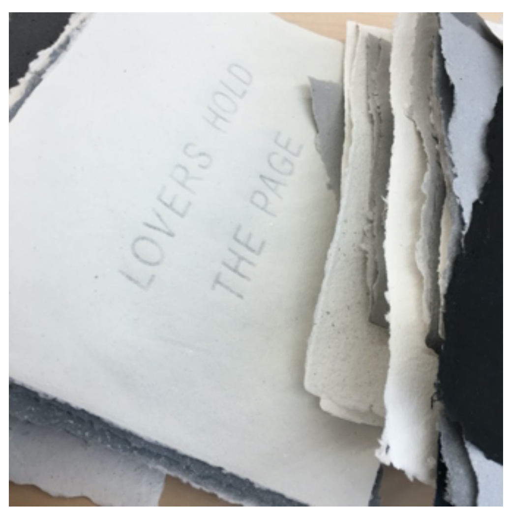
Figure 4 Sayward Schoonmaker, Authoritative Forms, 2019–20.

The physical and textual presence of Authoritative Forms tries to frustrate the assumption of authority: the papers can go in any order, the text resists syntactic coherence, the viewer can read or not read, sit and chat at the table and never touch a paper. The papers meander through objects and ideas of authority. Some refer to the precarity of our contemporary information-seeking habits within the overwhelming scale and speed of the internet age. Others invite a visual deconstruction of the document (figs. 5–6) and visually experiments with the word form . Amid original text are excerpts from texts by John Berger on the power of the gaze;<sup>1</sup> James Schuyler on the contextual nature of language;<sup>2</sup> and Hito Steyerl on perspectival space.<sup>3</sup> Throughout, refrains repeat (LOVERS HOLD THE PAGE/ MOM! / DAD!), as a kind of invocation or prayer for deciding our own