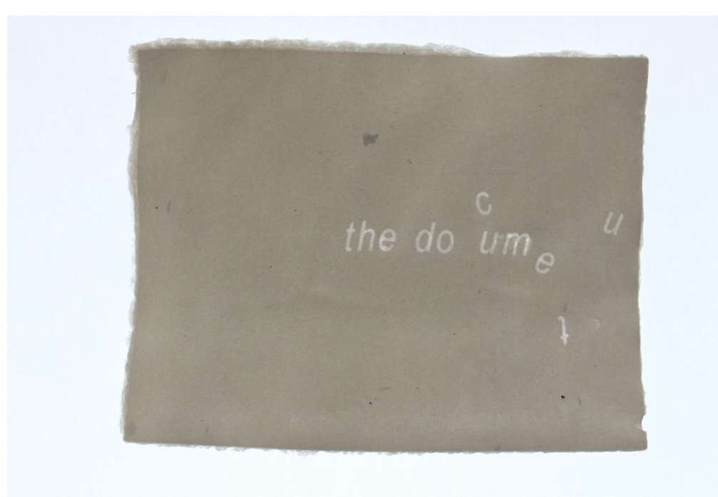
Figure 6 Sayward Schoonmaker, Authoritative Forms, 2019–20.