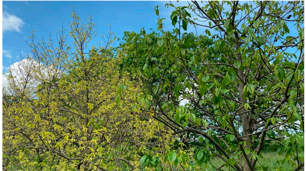
Figure 1. Symptomatic (left) and asymptomatic (right) pawpaw trees in an experimental orchard in Lansing, NY. The photo was taken in May 2022.

virus (ToRSV) (Table 1). TRSV and ToRSV are members of the species Nepovirus nicotianae and Nepovirus lycopersici , respectively, of the genus Nepovirus in the family Secoviridae [6]. No other contigs with at least 80% nucleotide or amino acid sequence similarity to other plant viruses for which sequences are available in NCBI GenBank were found in tissue from symptomatic or asymptomatic pawpaw samples, except for Phaseolus vulgaris endornavirus 1 (PvEV1) and Phaseolus vulgaris endornavirus 2 (PvEV2), as expected, because the pawpaw leaf tissue was spiked (5%, wt/wt) with leaf tissue of Phaseolus vulgaris 'Black turtle soup' infected with PvEV1 or PvEV2 prior to total RNA isolation.