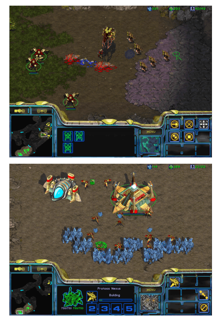
Figure 1: Screenshots from the strategy video game Starcraft: Brood War. Top, the aftermath of a skirmish between Protoss and Zerg units. Bottom, Protoss workers mine minerals and gas in the Protoss player's main base.

Starcraft's asymmetry is integral to its appeal. Players play as one of three factions, Zerg, Terran, or Protoss, with each faction having a completely distinct set of units and buildings. Games progress very differently depending on the match up, the combination of factions, present in the game. There are