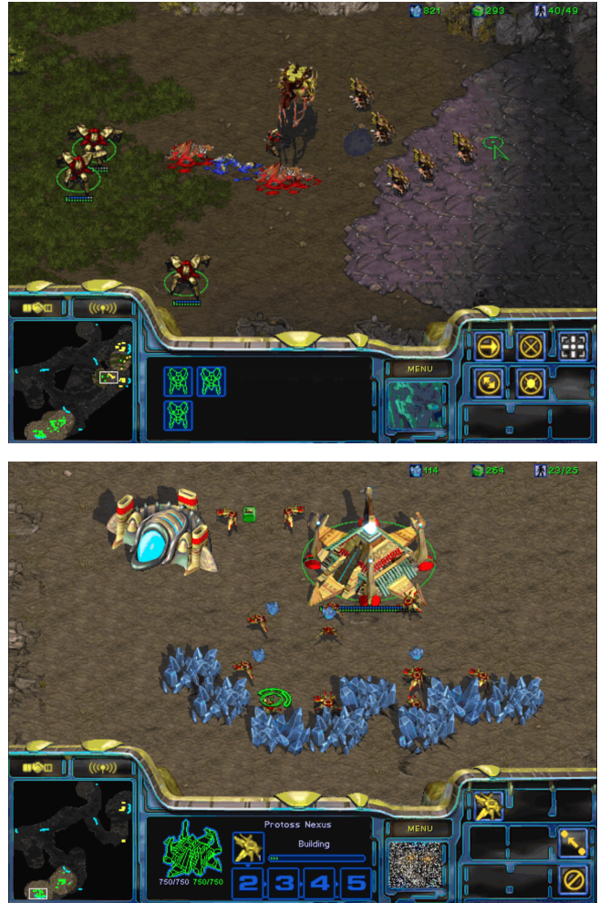
Figure 1: Screenshots from the strategy video game Starcraft: Brood War. Top, the aftermath of a skirmish between Protoss and Zerg units. Bottom, Protoss workers mine minerals and gas in the Protoss player’s main base.

six possible combinations, the mirror match ups: Zerg vs. Zerg (ZvZ), Protoss vs. Protoss (PvP), Terran vs. Terran (TvT), and the mixed match ups: Zerg vs. Terran (ZvT), Zerg vs. Protoss (ZvP), Terran vs. Protoss (TvP). A complete discussion of the strategic differences between the match ups is outside the scope of this paper, but suffice it to say that they are substantial enough to warrant separate analysis.