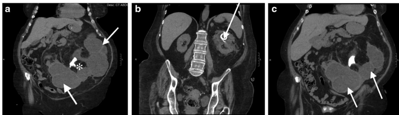
FIG. 1. Noncontrast CT images of a 64-year-old woman with chronically obstructed horseshoe kidney. (a) Noncontrast CT (May 2016) shows left moiety of horseshoe kidney obstructed with staghorn calculus (*), causing massive pyonephrosis (arrows). (b) Marked interval improvement in superior pole pyonephrosis of left moiety of horseshoe kidney status postpercutaneous nephrostomy tube placement (arrow). (c) Persistent severe pyonephrosis (arrows) in interpole and inferior pole of left horseshoe kidney moiety prompted placement of second percutaneous nephrostomy tube.

specific antibiotics. Repeat CT scan 2 weeks later revealed significant decompression of the left moiety upper pole (Fig. 1b), but an undrained area of the lower pole remained (Fig. 1c), which was managed with an additional percutaneous drain.