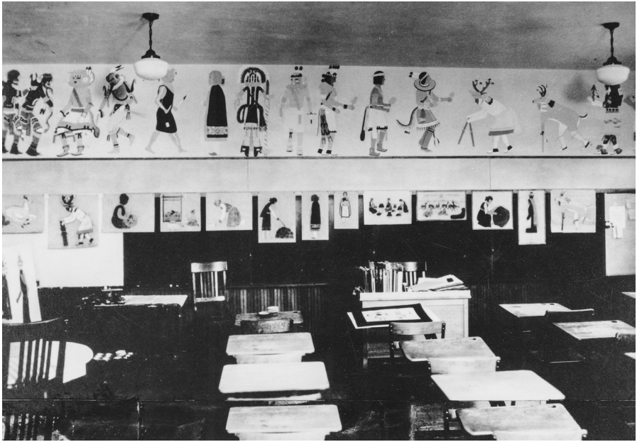
FIGURE 2: Santa Fe Indian School, ca. 1935. Oscar Howe Papers, Archives and Special Collections, University of South Dakota.