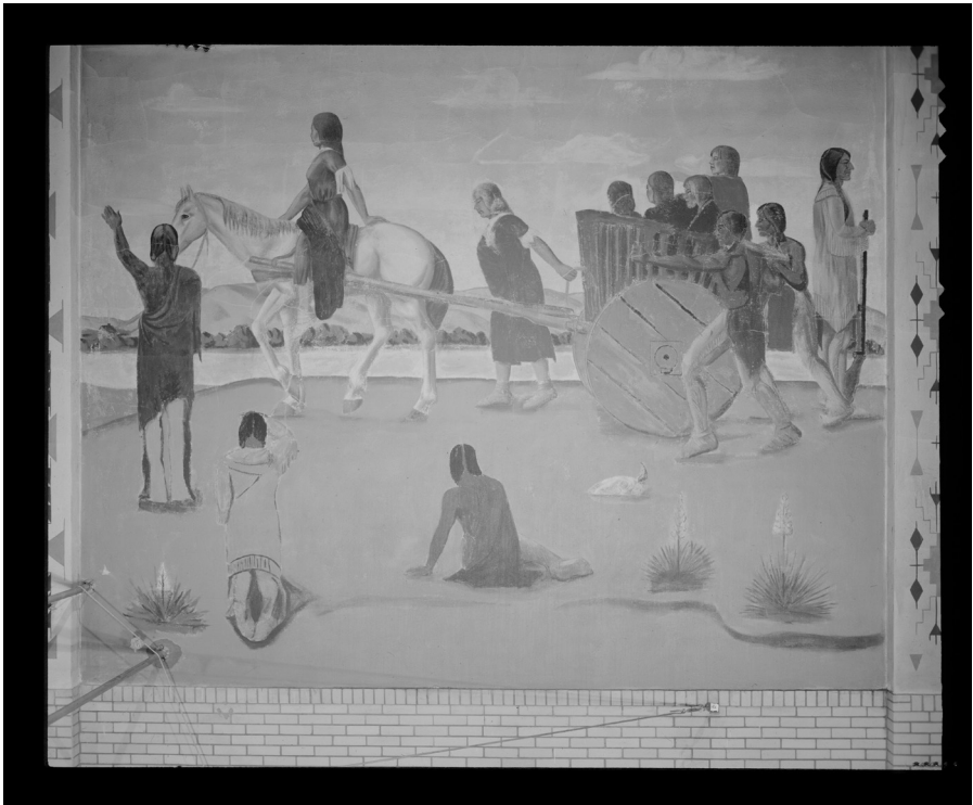
FIGURE 5: Oscar Howe ( Yanktonai Dakota), History Along the Missouri, Fool Soldier Rescue, c. 1942. Scherr-Howe Arena, Mobridge, South Dakota.

Velarde, in fact, became one of only two American Indian women to win a New Deal art commission when hired to paint depictions of Pueblo Indian life for Bandelier National Monument in northern New Mexico, probably recommended by her former teacher Dorothy Dunn. 56 Velarde lived at Bandelier at two different times, first in 1939 and then again through separate funding during the winter of 1946–47. There Velarde completed eighty-four paintings, but later distanced herself from these works, noting that she had come to see them as “amateurish.” Nonetheless, the Bandelier residencies were a crucial period for Velarde. With the freedom to experiment with new techniques, she deepened her skills by adding perspective and scale to create depth in her paintings. The Bandelier paintings were very different from those produced during her Studio years and represent a crucial link to the mature style that she developed in the 1950s. While at Bandelier, Velarde not only worked from her own experiences, but also conducted research and visited with elders at Santa Clara so as to accurately depict details such as “how to make moccasins, how to make pottery, which plants were used for medicine, and how they built the houses.” Thus, as New Deal art commissions had done for other artists, the Bandelier commission provided a space for Velarde to