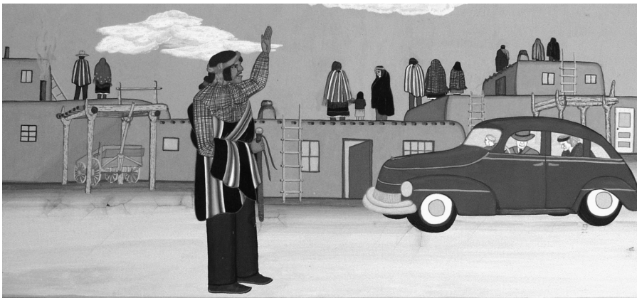
FIGURE 6: Pablita Velarde ( Santa Clara Pueblo), Governor Welcoming Tourists/Guard Turning Tourists Away, ca. 1940.

Ultimately, it may have been a small issue for Velarde, who had struggled for many years to gain recognition as an artist and appreciated that “People were beginning to take an interest in me and my paintings” at Bandelier, and later remembered of her time there that “if it hadn’t been for the Park Service, I . . . wouldn’t have had the nerve to keep it up.” 60 It is likely that Howe, the Kiowa artists, and other Native American painters took a similar view in reconciling the tensions between cultural and artistic autonomy and the opportunities provided by New Deal commissions to put their visions of Native American history and culture into the public sphere while earning a living as artists. Indeed, during the decades that her paintings were exhibited in the park’s visitor center, Velarde became one of the best known and respected American Indian artists of the twentieth century. 61