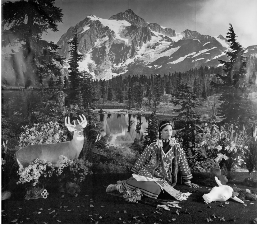
FIGURE 9: Wendy Red Star (Crow), Indian Summer-Four Seasons, 2006. Used by permission of the artist.