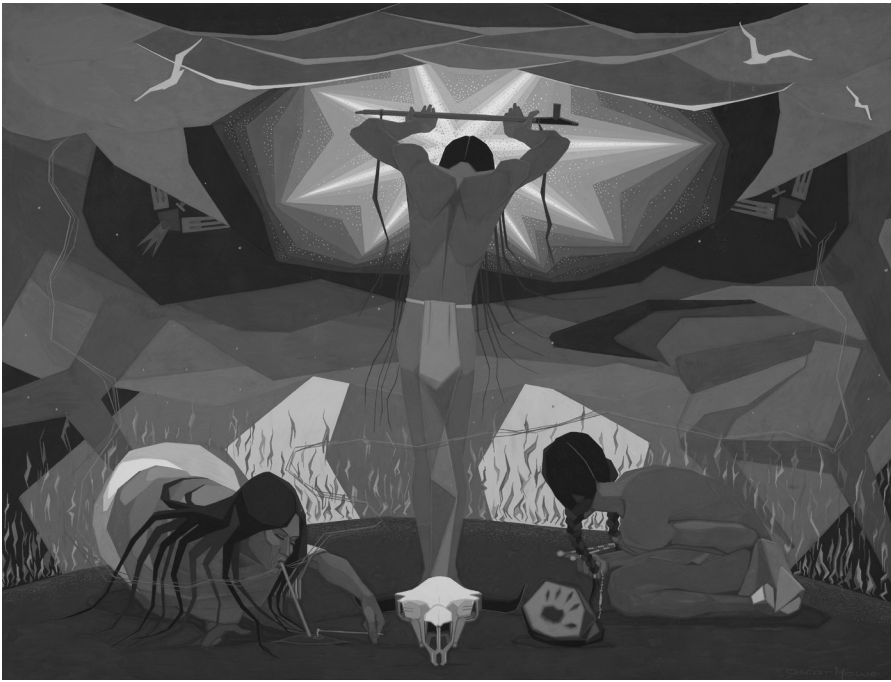
FIGURE 8: Oscar Howe ( Yanktonai Dakota ), Calling on Wakan Tanka, 1962, University Galleries, University of South Dakota.

influences in representing Native America, including works that highlight the tensions between American Indian experiences and the ways that Native peoples continue to be portrayed in films, literature, advertisements, youth and fraternal organizations, sports, and other venues. The Crow artist Wendy Red Star's Four Seasons (2006; fig. 9), for instance, features the artist herself dressed in traditional regalia and posed in four diorama-like settings, surrounded by objects often used to invoke Native stereotypes. 70