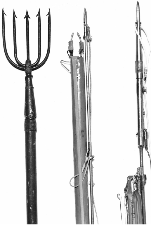
Figure 6: Jack Prodanovich Spear Points