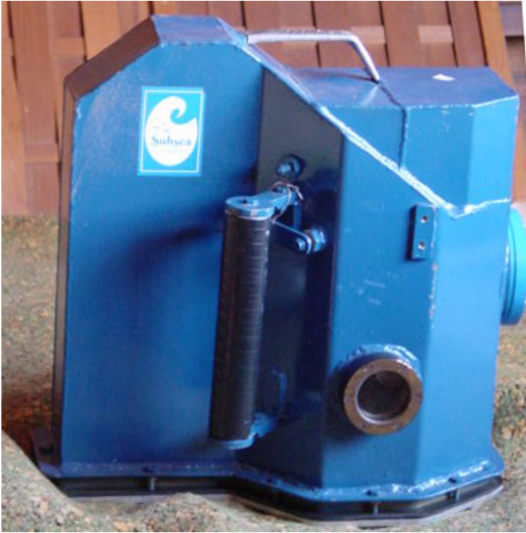
Figure 10: First San Diegan Hand-Crafted Underwater Movie Camera Case – S.D.B.S.C ~1950's