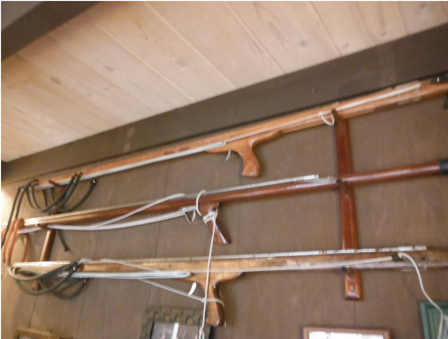
Figure 7: Frank Leinhaupel's Collection: Antique Original Addict's Guns