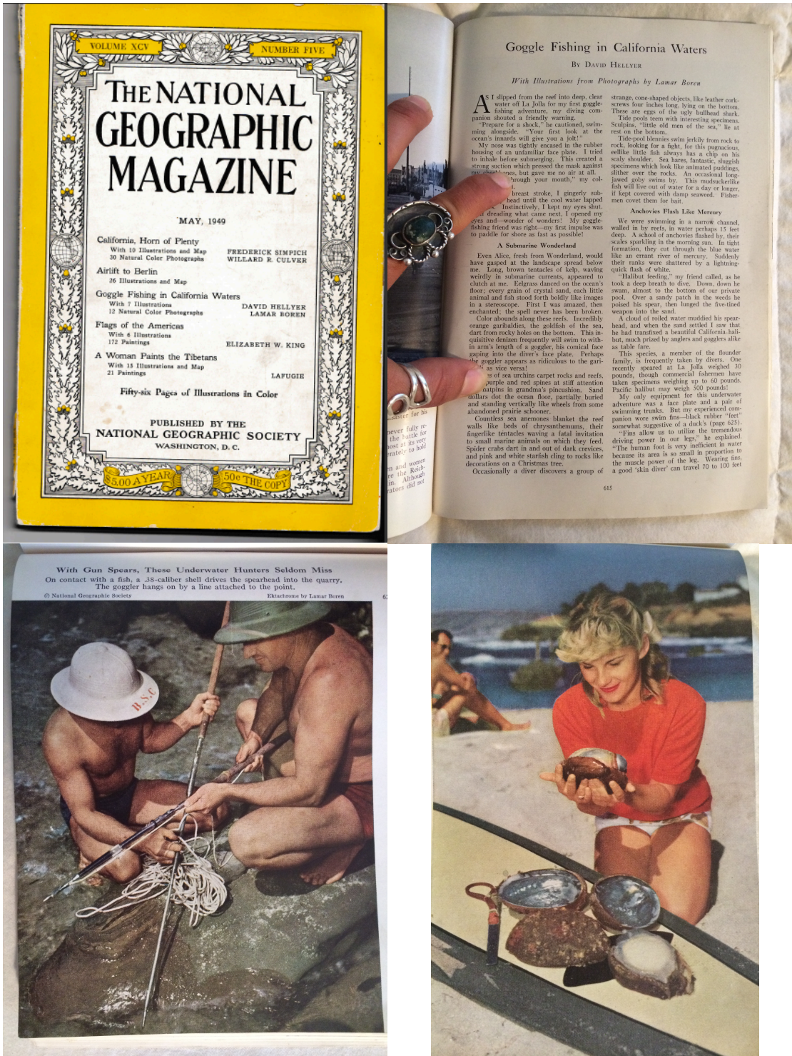
Figure 5: National Geographic Magazine, Vol. XCV Number 5. May, 1949.