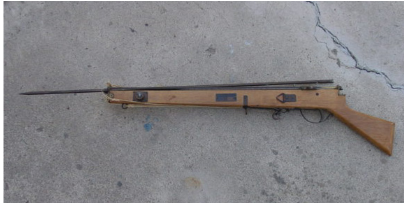
Antique B.S.D.C Speargun ~1940's