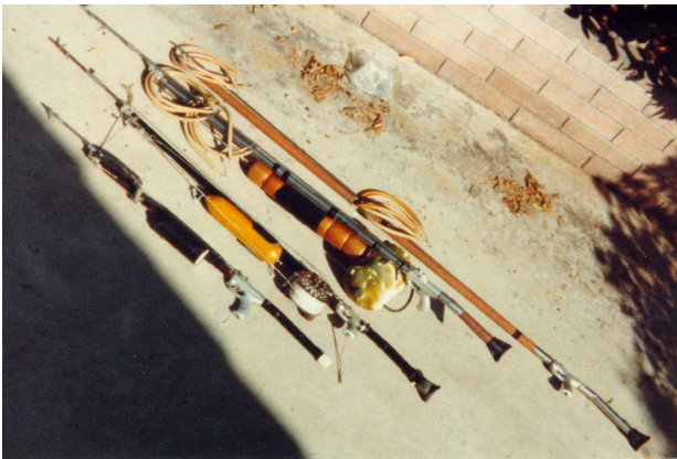
Antique B.S.D.C. Spearguns ~1950 - 1970