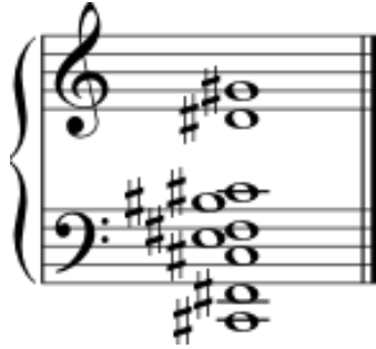
Figure 9: Final chord in Hungarian Etude No. 2