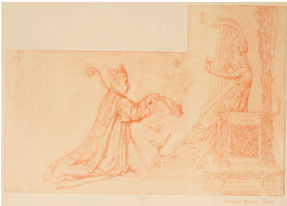
Fig. 5, Giulio Aristide Sartorio, "Vas spirituale," Isaotta Guttadàuro ed altre poesie (Roma: Editrice La Tribuna, 1886), 107.