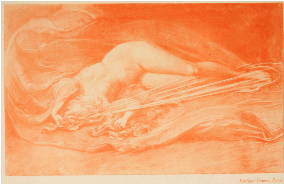
Fig. 4, Giuseppe Cellini, "Grasinda," Isaotta Guttadàuro ed altre poesie (Roma: Editrice La Tribuna, 1886), 81.