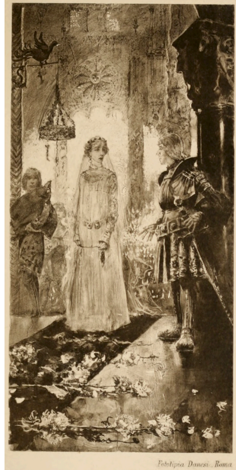
Fig. 1, Giulio Aristide Sartorio, “Ballata d’Astioco e di Brisenna,” Isaotta Guttadàuro ed altre poesie (Roma: Editrice La Tribuna, 1886), 5.