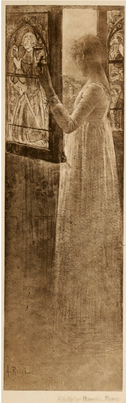
Fig. 3, Alfredo Ricci, "Il dolce grappolo, II," Isaotta Guttadàuro ed altre poesie (Roma: Editrice La Tribuna, 1886), 17.