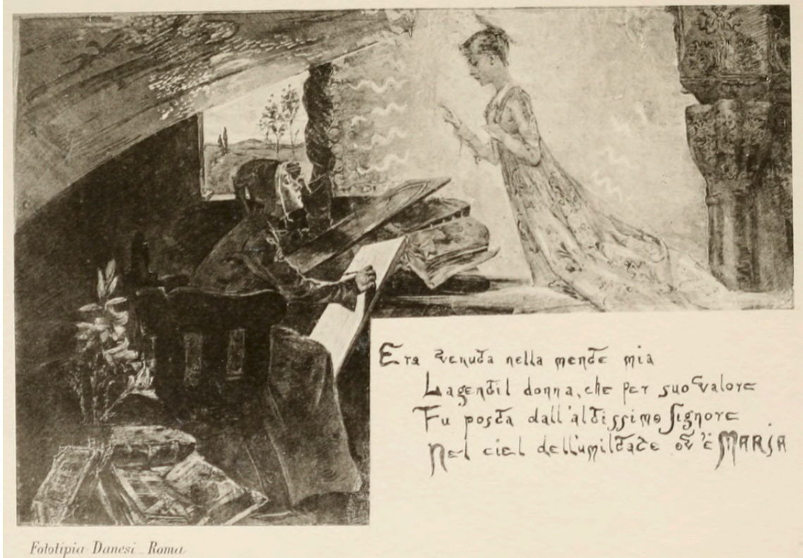
Fig. 8, Giulio Aristide Sartorio, "Viviana," Isotta Guttadàuro ed altre poesie (Roma: Editrice La Tribuna, 1886), 285.