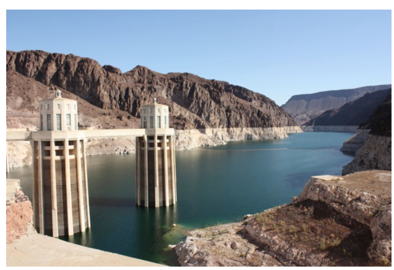
Hoover Dam.

Like other renewable power systems, hydroelectric power plants generate electricity without emitting greenhouse gases or other air pollutants.<sup>254</sup> In addition, hydroelectric power also has a number of other benefits. Hydroelectric power plants provide consistent, reliable generation that can be quickly dispatched and adjusted to meet changes in electricity de-