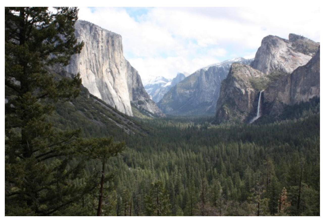
Yosemite National Park, California.

from which to measure future climatic changes.<sup>307</sup> Additionally, by showing how ecosystems have responded to past climate variations, park information can also be used to predict the impact of such changes. 308 In addition to advancing scientific knowledge, national parks can also be used to increase public awareness of climate change. As the effects of climate change occur over long time periods and wide geographic areas, it is often perceived as an abstract and distant threat. 309 National parks can be used to demonstrate the real and immediate effects of climate change and thereby inspire mitigation measures. 310 As the DOI's NPS has observed, "[w]ith more than three million visitors each year, the NPS has an unparalleled ability to tell compelling stories and connect people with places they care about."311