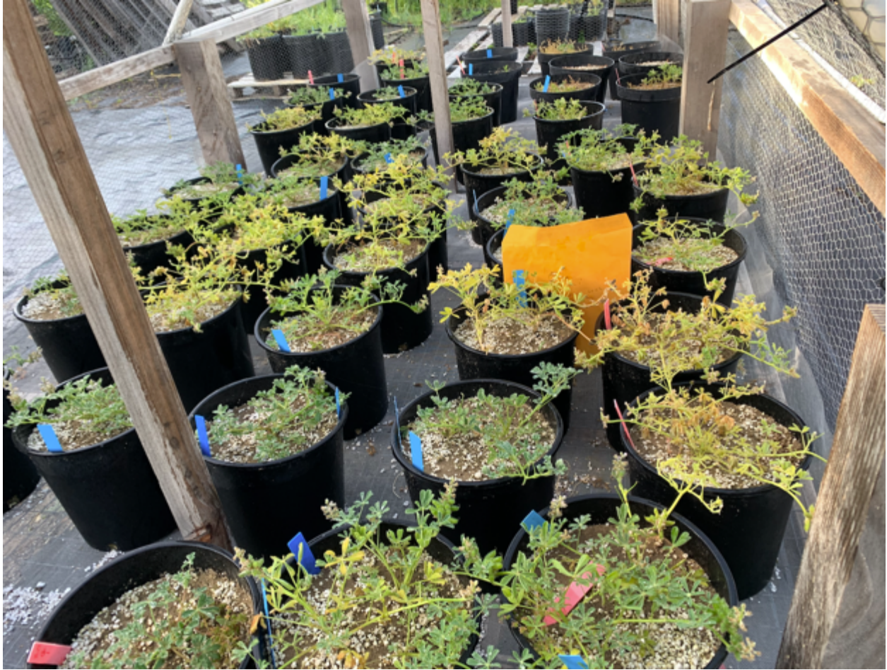
Figure 3. Lupinus nipomensis plants during seed collection

Since the fruits pods of Lupinus nipomensis mature at a steady rate once fully developed, seed collection must be done numerous times per day, every day, to avoid missing ripening fruits and seed being lost. Since this was occurring due to less available seed collectors, some pods were prematurely harvested when beginning to turn yellow in anticipation that they would after ripen in the collection bag. This has been a normal technique in our collecting of the species' seed, but was pushed somewhat farther in some instances when warm weather was anticipated and no seed collection would be possible, for fear of losing more seed. Fully viable seeds are usually glossy, mottled, dark brown, and plump, while typical non-viable seed are often matte, yellow, and compressed.