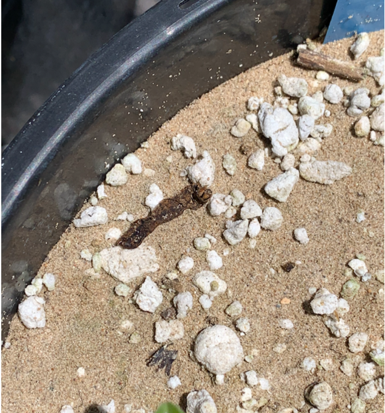
Figure 2. Large dead caterpillar after treatment with BT.

Seed was collected numerous times per day or week as time allowed, however less hands were available for this time sensitive task (Figure 3).