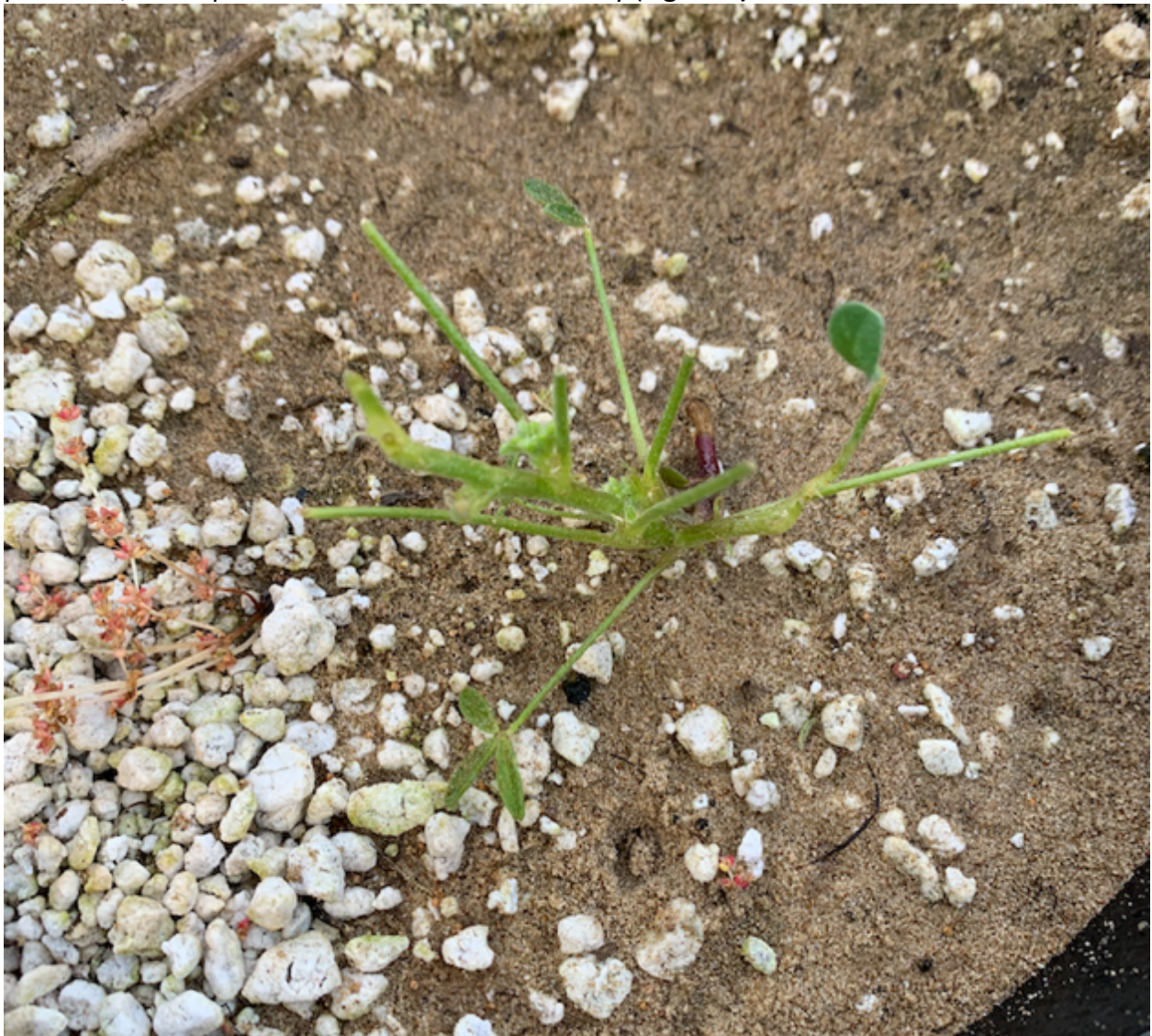
Figure 1. Lupinus nipomensis heavily predated by caterpillar

predation, and repeated treatments were necessary ( Figure 1 ).