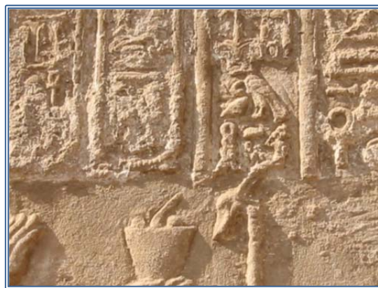
Figure 9. Door decorated under Ptolemy VIII: mention of sdm nht in the inscriptions of the south jamb.

If the contra-temple of Thutmose III and the Temple of Amun-Ra/Ramesses-Who-Hears-Prayers are two distinct architectural units, then all buildings, which were constructed east of the contra-temple (with exception of those added by Amenhotep IV), may be considered to a certain degree extensions of the “Place of the Hearing Ear,” as already suggested by Nims (1971: 58). The concomitant use of the epithets msdrwy sdm , “the hearing ears” (Wagner and Quaegebeur 1973: 58), and sdm nht , “who listens to the prayers,” in the inscriptions of Ptolemy VIII in the Eastern Temple seems to confirm this (fig. 9).