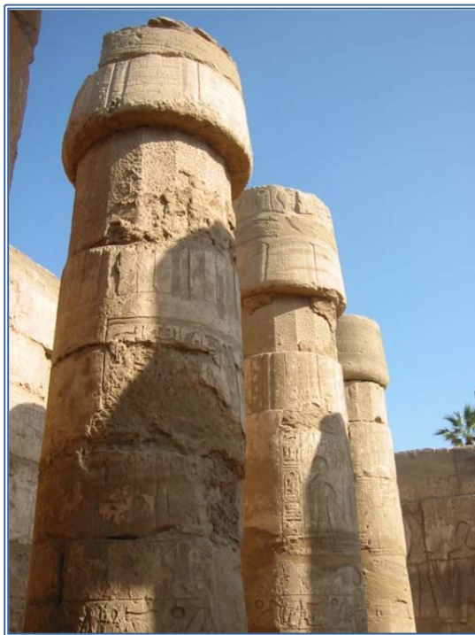
Figure 6. Peristyle court: columns with reused polygonal drums and thick layers of coating.

The imposing wadj -columns of the peristyle court, a completely Ramesside concept, are made of half cylinders and roughly hewn blocks smoothed over with mortar (in some areas over 10 cm thick). Polygonal drums, with 16 cut planes, identical to those of the hypostyle hall, are exclusively and intelligently used in the narrow parts of the column shafts: under the capital and the lowest drum, which corresponds to the part where the shaft is constricted. It would have been necessary to plaster them to a larger thickness if they had been indiscriminately employed at a wider part of the column. Moreover, the ribs were not leveled and the cupules not filled up: it was not a necessity because the entire column was supposed to be covered in a generous layer of plaster, and the ribs and cupules would actually have facilitated the adhesion of the plaster (fig. 6).