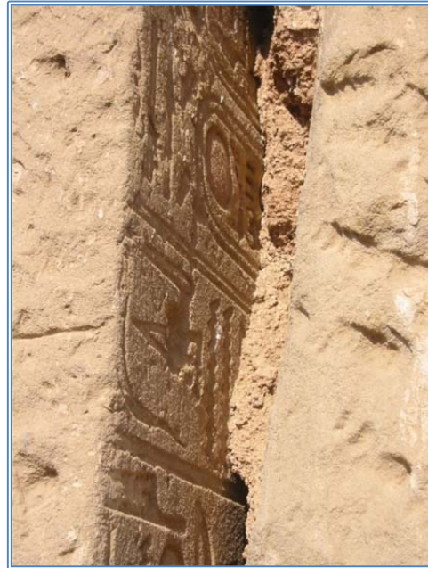
Figure 7. Cartouche of Horemheb in the south masonry of the door.

from the level of erasures of the relief decoration in the peristyle court and considering the signs of reuse found on the gate, the first edifice could have been erected and inscribed under Horemheb, but this remains to be confirmed.