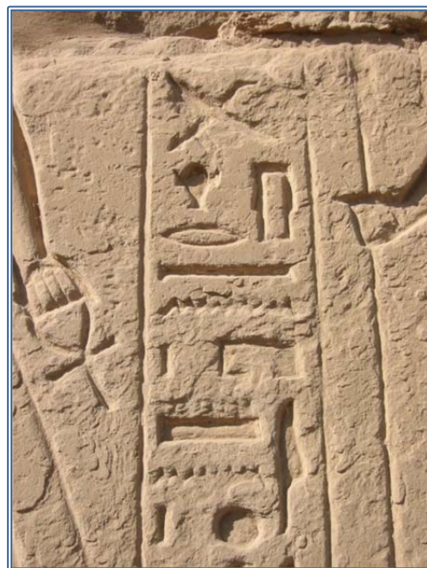
Figure 8. Entrance of the temple: south jamb of the door with mention of the “Upper Gate.”