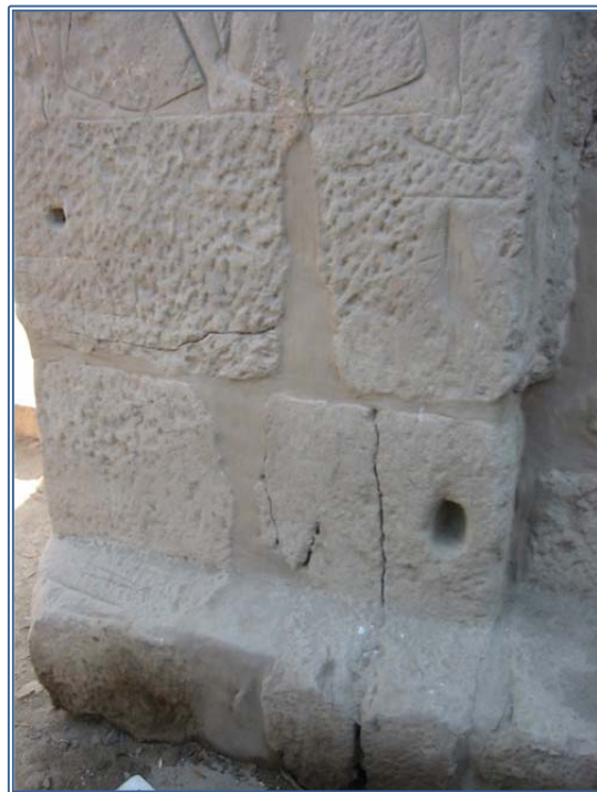
Figure 4. North door of the temple, west jamb, stone extrusion of the masonry.