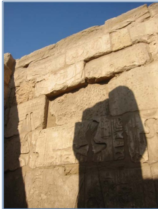
Figure 3. Peristyle court, north wall: detail of the masonry and of a “stone plate” that has fallen out.