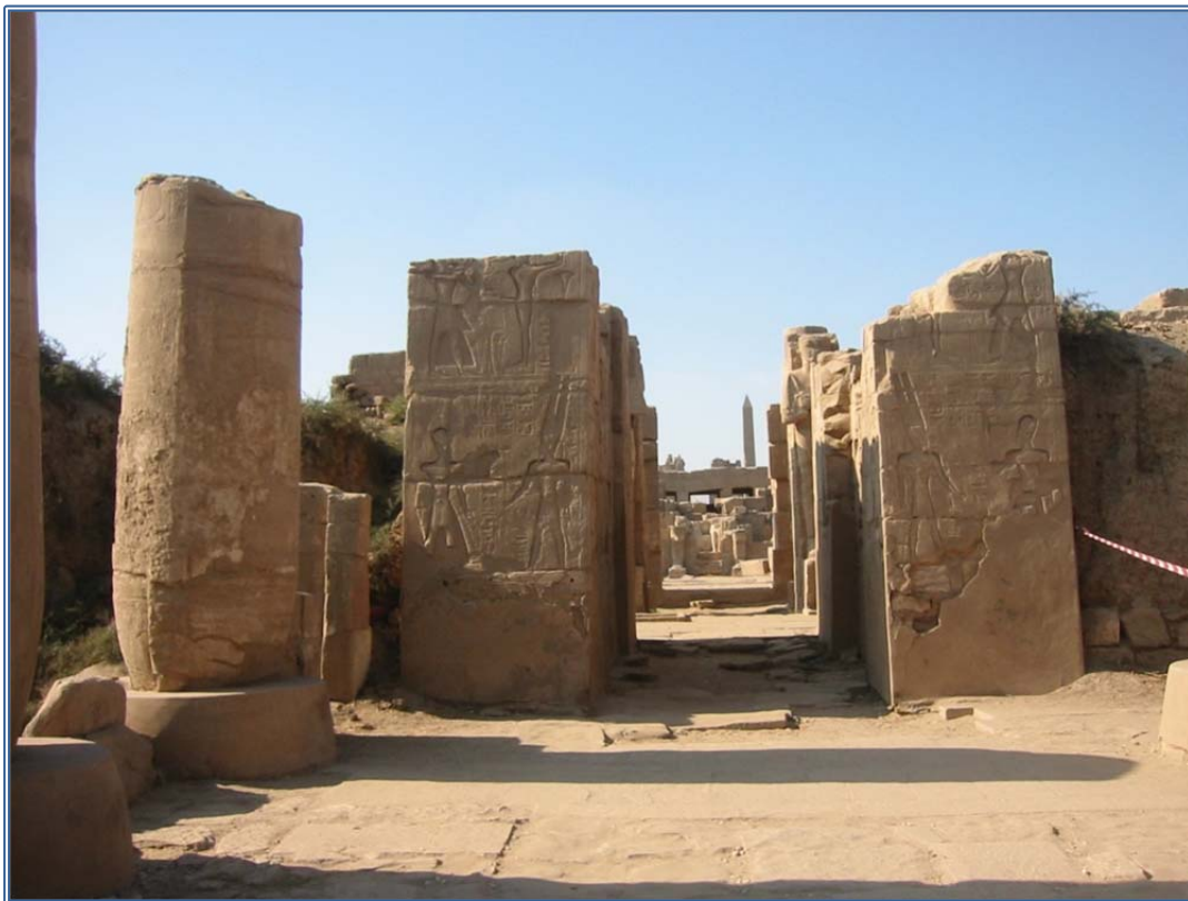
Figure 2. Entrance of the temple of Amun-Ra-Who-Hears-Prayers (the Eastern Temple) at Karnak.