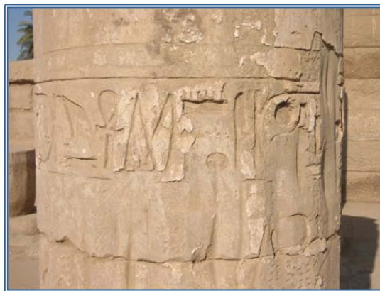
Figure 5. Column of the hypostyle hall transformed into wadj -columns during the Ramesside Period. Detail of the inscriptions of Ramses II made in the coating.

scrapes, to collect stone powder for magical purposes) almost everywhere on their surface. Ramesses II then abraded the circular collar of the lower drums and the ridges of each polygonal column, replastering them to obtain the curve of a wadj -column, filling the cupules, and inscribing his texts (fig. 5). After performing this change, the former guideline on the column bases reappeared. The temple elements were thus reused in situ under Ramesses II, who simply recut and decorated the unfinished columns. We should, however, not disregard the hypothesis that Ramesses II could have reused the bases separately from the proto-Doric column shafts, which may have been brought in from another geographical location, having been put in their present place before being recut and decorated. This complex scenario would suppose that under Ramesses II the undecorated polygonal column shafts were erected in their new position while care was taken to fit them meticulously in the same place so that the cupules, which often bridge two column drums, fit exactly, as they were in their hypothetical previous location. Although this scenario seems less probable, examples of such refitting have been attested elsewhere (Traunecker et al. 1981: 61).