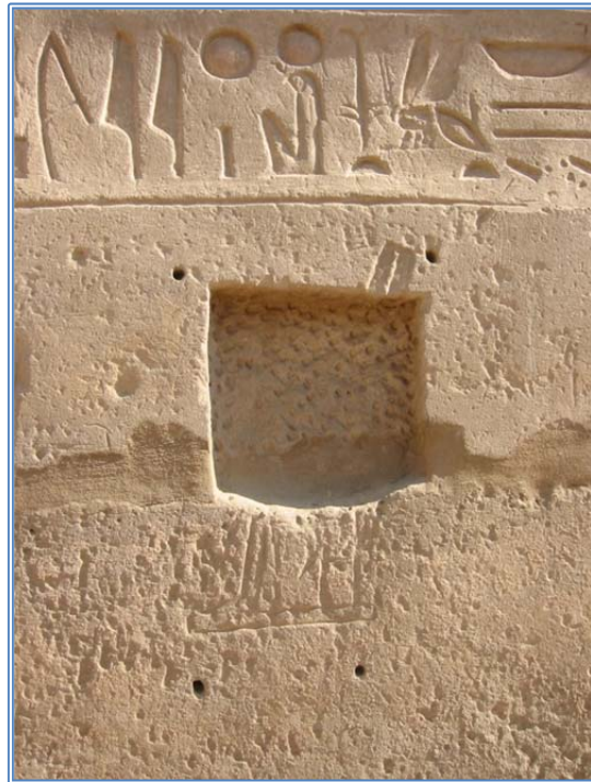
Figure 10. Graffito of Amun at the entrance of the peristyle court: small cult device, support of personal devotion.

Surprisingly in the sector where Amun and the pharaoh lent their benevolent ears to prayers, not one ostrakon bearing texts with prayers has been found, nor were any stelae with ears, ad- or ex-voto, discovered in this context. However, the neighboring areas, north of the temple and around Nectanebo’s gate, have never been excavated.