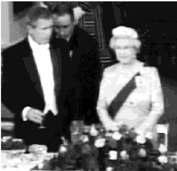
Fig. 4 President George W. Bush realizes that the Queen is facing away from him and not reciprocating his toast by lifting her glass (November 19, 2003)

The rest of the interaction is without obvious “mishaps” and “repairs.” The band starts to play “God Save The Queen” while everyone is standing still. On the last note of the hymn President Bush first and then Queen Elizabeth look down and then they both lean over to grab their own glasses, which they raise while turning to look at each other, with the Queen smiling at President Bush. Then they both turn away from each other, raise their glass to others in the audience and then put it down without either one of them drinking from it. As soon as both the President and the Queen are