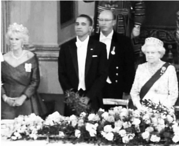
Fig. 6 Obama stands with his hands clasped as he joins the rest of the participants in listening to “God Save The Queen” after completing his verbal toast

that accompany differing media outlets’ efforts at capturing and broadcasting the event. Each of these objects and individuals exude differing intensities of attentional pull and are possible foci of attention. As a result, differing individuals may have attended in different ways to various aspects of the setting.