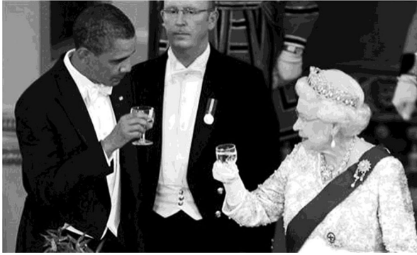
Fig. 7 President Obama and Queen Elizabeth raise their glasses while facing each other after the band has just finished playing “God Save The Queen” (May 24, 2011)

culturally prominent music was already acting, we would argue, as an “amplifier” of the violation of the protocol, in watching him wait, we now have an extended opportunity to feel sorry, embarrassed for him, or annoyed by him.