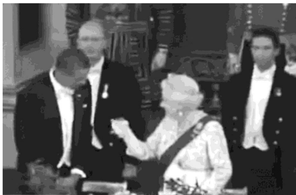
Fig. 2 Completing her toast to President Obama Queen Elizabeth lifts her glass and smiles at the President who reciprocates smiling and bowing (May 24, 2011) (frame grab from BBC footage of event http://www.bbc.co.uk/news/uk-13537972 )

Transcript # 2 (Same seating arrangement as shown in Transcript #1, but earlier in the evening. The Queen is at the end of her speech and begins her toast)