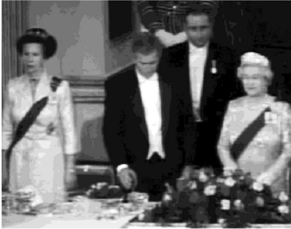
Fig. 5 President Bush puts down his glass once he realizes that the Queen and others are not following him in raising their glass (November 19, 2003)

seated, the rest of the guests initiate applause. From the point of view of the analysis of the speech act “toast,” this case shows remarkable similarities with President Obama’s toast. President Bush’s verbal toast also “misfires” because he starts to complete the toast with the raising of his glass but this non-verbal part of the ritual is not reciprocated by the Queen, forcing him to give up on the completion and to wait until later to “repair” it by raising his glass again when the Queen raises her glass and turns to him after the end of “God Save The Queen.”