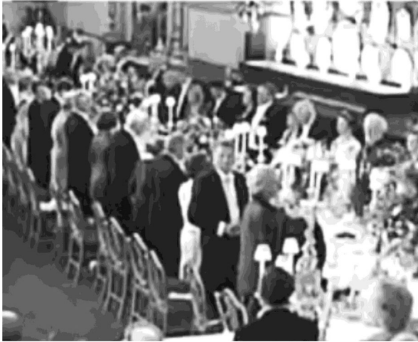
Fig. 3 Guests stand after the Queen has made a verbal toast to President Obama and Mrs. Obama (May 24, 2011)

Fig. 4). President Bush then “repairs” his (by now evident to him) “error” by quickly putting down his glass (see Fig. 5)