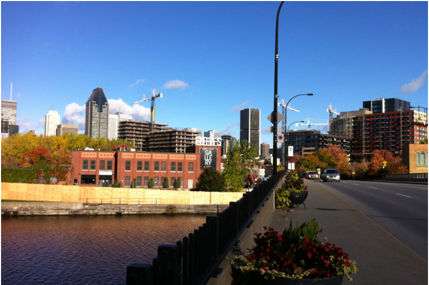
Construction en ville, looking east from Lachine Canal.