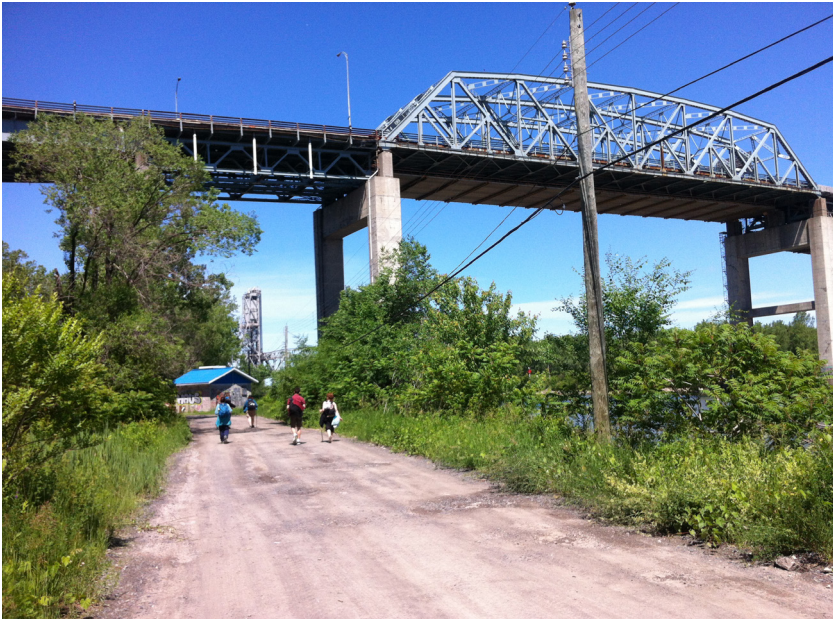
Service Road between Ville de Ste-catherine and Kahnawa:ké, with Mercier Bridge.

embodied engagement of the researcher in the landscape becomes part of the story of that space. His approach to the human-landscape relationship, whereby both person and environment have transformative agency, is relevant to both country and cityscapes, and integrates creatively with Indigenous methodological insights, and with pilgrimage practice. He writes: