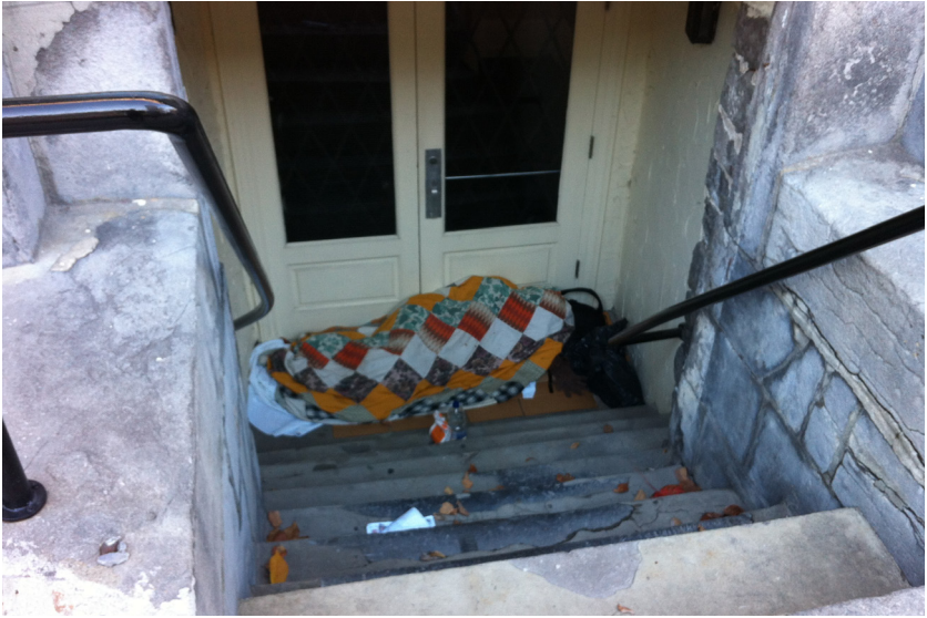
Homeless in southwest Montreal.