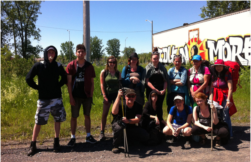
Pilgrims and “Idle-No-More” graffiti, service road between Ville de Ste-Catherine. http://www.idlenomore.ca/