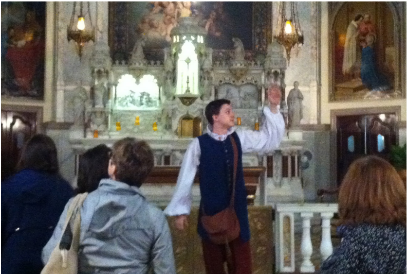
Opposite: Inside the Chapelle de Notre-Dame-de-Bonsecours (group shot with chapel guide in period costume).