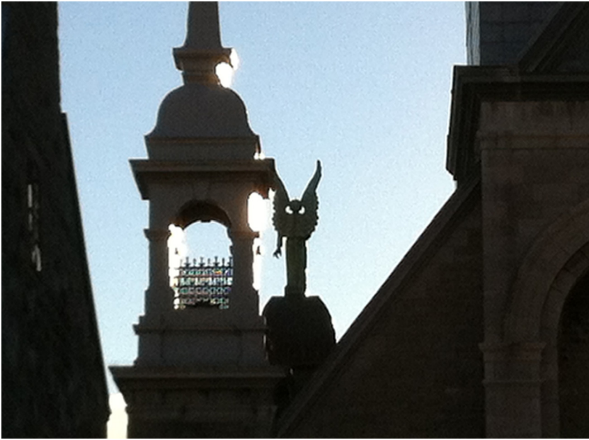
Contre-jour shot of angel at Bon-Secours Chapel.

The “De Vieux-Montréal à Kahnawa:ké” pilgrimage, walked in June 2014, was the third field trip we designed and led as part of a pilgrimage studies course that we team-teach at Concordia University Montréal. Concordia is an urban, secular and public comprehensive university; the course is jointly offered by the Department of Theological Studies and the Loyola College for Diversity and Sustainability. Our students are a profoundly diverse group culturally, linguistically, and religiously, and in terms of disciplinary foci. This walk was our first such trip in North America, hence in what was originally Aboriginal territory. It was also our first pilgrimage through a mainly urban and suburban landscape. As a pilgrim group from settler backgrounds, we had first to acknowledge that the original narrative of the land we would walk was the story of the original people of that land.