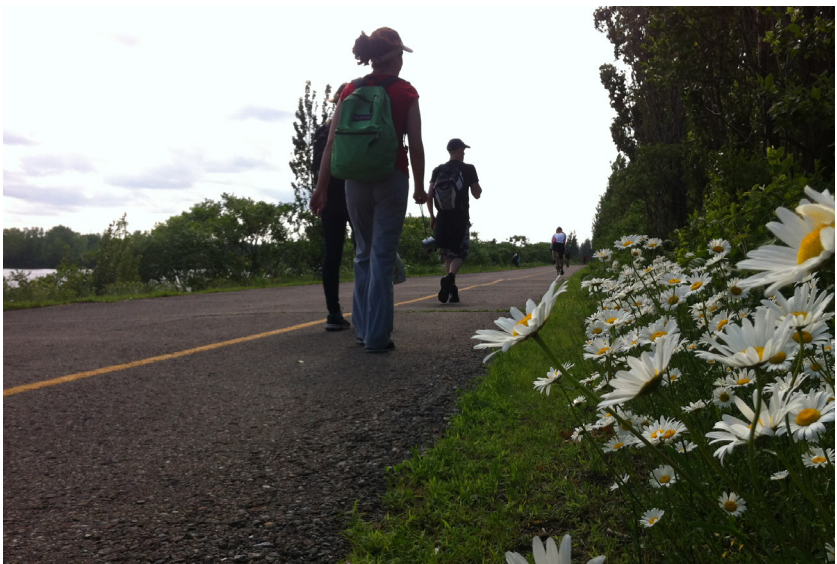
Daisies on the embankment (narrow strip of land in St. Lawrence Seaway).