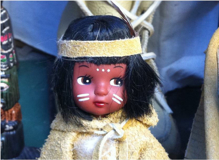
“Indian” princess dolly in tourist shop in Vieux-Montreal.

of the walk, in the sense that modern roads and transportation have drastically shortened the travel time that Kateri would have taken to visit Marguerite. Urbanization and the histories it represents have all but obliterated the somewhat straighter cultural, spiritual and human path that once existed between the two poles of our journey.