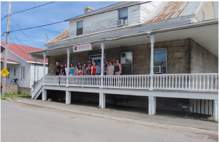
Pilgrims at the Riverside Inn, Kahnawa:ké.