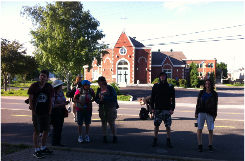
Eglise Sainte-Catherine d'Alexandrie, ville de Ste-Catherine, the basement became our hostel for night one.