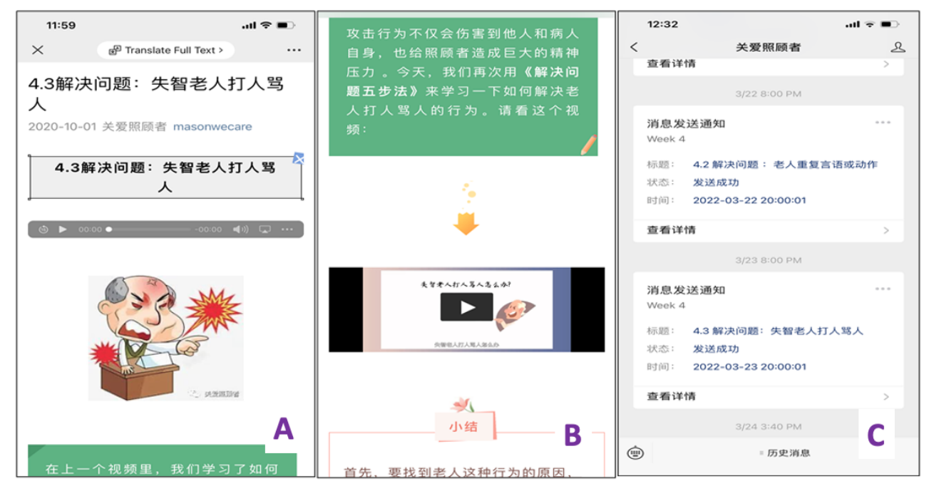
Figure 1. Wellness Enhancement for Caregivers (WECARE) screenshots: (A) a multimedia article with audio recording on how to deal with the angry behaviors of persons with dementia; (B) a short video clip as a case study to explain angry behaviors of persons with dementia; and (C) push notifications and progress summary.