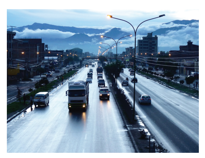
Avenida Blanco Galindo, Cochabamba.

In January, urban and rural communities coordinated their efforts in the first of several regionwide blockades. Unions took charge of six bridges across the Rocha River into downtown Cochabamba, the Regantes maintained control