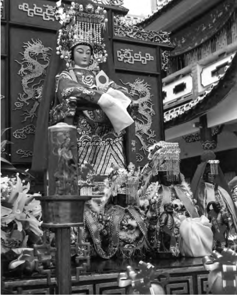
Figure 12.2. The Meizhou Mazu goddess hosting her Taiwan Mazu guests in her temple courtyard, Meizhou Island, Fujian Province, July 2000.

entire hillside complex. It was in 1979 that a Taiwanese fisherman first snuck onto the island and started to worship at a small Mazu shrine the locals had secretly erected. The fishermen returned, bringing with them a metal incense burner, candleholders, and other ritual paraphernalia with which to pay homage to Mazu. Although the first two Meizhou temple halls were built in the 1980s with local donations, more recent structures