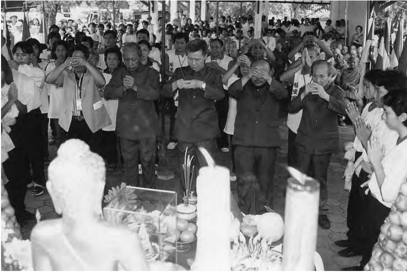
Figure 1.1. Tridharma (Sam Kauw Hwee, or Three-in-One Society) devotees in modern Indonesia.