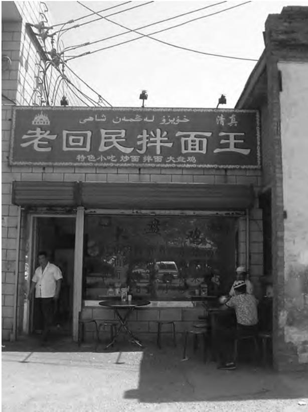
Figure 7.1. Hui (Chinese Muslim) restaurant in Urumqi, Xinjiang Province.

demographic proximity and cultural accommodation than are the other Muslim nationalities in China, adapting many of their Islamic practices to Han ways of life. This type of cultural accommodation can be the target of sharp criticism from some Muslim reformers. In the past, this was not as great a problem for the Turkic, Mongolian, and Tajik groups because they were traditionally more isolated from the Han and their identities not as threatened, though this has begun to change in the last forty years. As a result of the state-sponsored nationality identification campaigns launched in the 1950s, these groups began to think of themselves more as ethnic nationalities, as something more than just “Muslims.” The Hui are unique among the 55 identified nationalities in China, and are the only nationality for whom religion (Islam) is the only unifying category