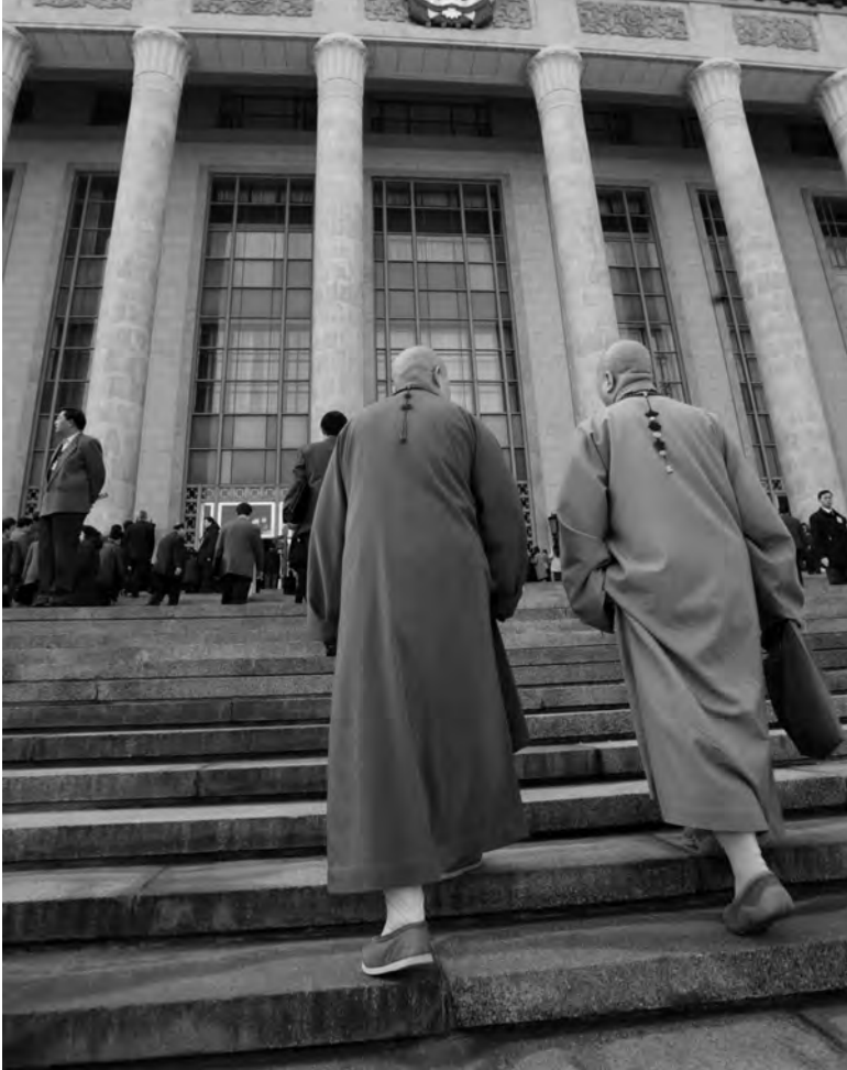
Figure 9.1. Two Buddhist monks entering the Great Hall of the People in Beijing for the Tenth National Committee of the Chinese People's Political Consultative Conference, March 8, 2003.

tion only mentioned that the BAC should “help the People’s Government fully carry out its policy of freedom of religious belief,” without any mention of the protection of Buddhists’ rights or their interests. In the 1980 version, the phrase “defend the Buddhists’ freedom of belief” was added as one task of the BAC, but this modest claim was still put after the item “to unite all the Buddhists and promote their participation in various works to serve the people.” In 1987, the order of the two tasks was significantly