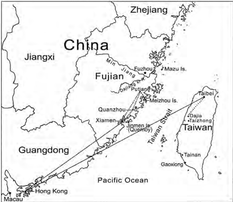
Map 12.1. Route of the pilgrimage of the maritime goddess Mazu from Dajia, Taiwan, to Meizhou Island, Fujian Province, July 2000. Map by Choonghwan Park and Han Xiaojuan.

ing regional media audiences and by limiting foreign media access to U.S. airwaves (Price 1994). The lack of cosmopolitanism in American television and other media served the Bush administration well in building popular support for the invasion of Iraq in 2003.