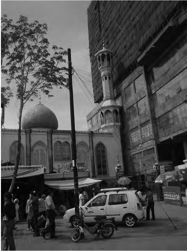
Figure 7.2. Uyghur mosque in Urumqi, Xinjiang Province.