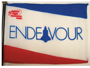
Figures 40-43: Small versions of four orbiter flags such as those flown as souvenirs on various Space Shuttle missions (Photos of flags in the collection of the author).

The initial set of flags is believed to have been created sometime after the loss of the Space Shuttle Challenger in 1986. For this reason, only four orbiters were represented - Atlantis, Columbia, Discovery, and Endeavour. On all four of these flags, the shuttle silhouette shows the orbiter as it would appear in orbit, with the payload bay doors fully open. On the flag for Atlantis, the shuttle substitutes for the second "A" in "ATLANTIS" and on the flag for Endeavour it replaces the "A" in "ENDEAVOUR". On the flags for Columbia and Discovery the silhouette overlaps the "O" in each orbiter name. Later, as the Space Shuttle Program was coming to an end flags were created for the other two orbiters – Challenger and Enterprise. On the Challenger flag the shuttle replaces the letter "A" and on that for Enterprise it replaces the letter "I". The orbiter silhouette on the Challenger flag is shown with the payload bay doors in the open position, just as on the flags for the other four shuttles that had flown in space.