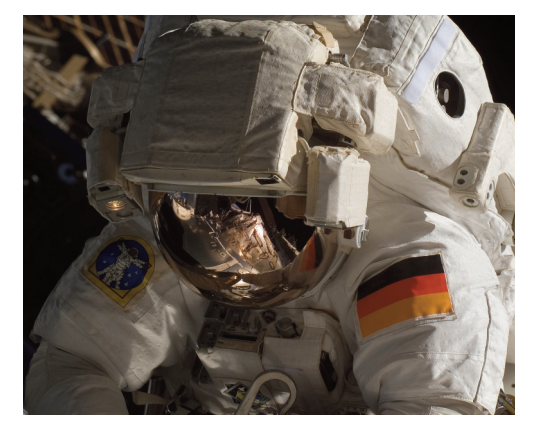
Figure 11: European Space Agency (ESA) astronaut Hans Schlegel displays the German flag on his spacesuit.

It was during the Space Shuttle Program that astronauts from other countries first launched into space aboard American spacecraft. Many of these represented the European Space Agency, including the first international shuttle astronaut, a West German who flew on the shuttle as part of the STS-9 mission in 1983. Throughout the course of the program, astronauts from many nations flew aboard the Space Shuttles. Countries represented included Belgium, Canada, France, Germany, Israel, Italy, Japan, Mexico, the Netherlands, Russia, Saudi Arabia, Spain, Sweden, Switzerland, and Ukraine. These astronauts (or cosmonauts, as Russian spacefarers are called) typically wore patches of their nation's flags on their spacesuits and flight suits just as their American crewmates did.<sup>10</sup>