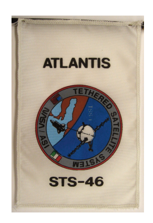
Figure 49: Flag for the Tethered Satellite System (TSS) payload (Image of flag in the collection of the author).

mission in January 1992. The flag features the payload emblem in the center of a white field. A blue border on the logo has white lettering reading "INTERNATIONAL MICROGRAVITY LABORATORY" with crossed leaves in white at the bottom. A symbol consisting of a disk with arrows projecting from the top and bottom has been substituted for the letter "O" in the word "microgravity". The arrows could represent gravitation force (downward) and centrifugal force (upward) which have an equal influence on the disk, suggesting that it is in a state of dynamic equilibrium. On a black background in the center of the emblem is a 3-dimensional octagon shape, perhaps representing the Spacelab module which was a mobile lab carried in the payload bay of the shuttle. In the center of the octagon is a stylized human form. Letters below read "IML-1". Outside the emblem at the hoist end of the flag in blue letters is the shuttle name "DISCOVERY" and at the fly end is the flight designation "STS-42". 19