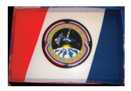
Figure 57: Flag for Phase 1 (often called "Shuttle-Mir") of the International Space Station Program (Image of flag in collection of the author).

outline of the flight emblem. As with the STS-115 flag, the Space Flight Awareness logo is shown only in blue and white. These three flags are perhaps just a sample of flags created for specific Space Shuttle missions. It is unknown if there are other examples that have yet to be discovered by the author.<sup>29</sup>