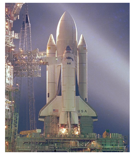
Figure 2: View of the Space Shuttle Columbia on the launch pad showing positions of the US flag and "USA" on the wings (NASA Photo, detail).