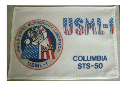
Figure 48: Flag for the US Microgravity Laboratory 1 (USML-1) payload (Image of flag mounted on a certificate presented to Rich Drake).