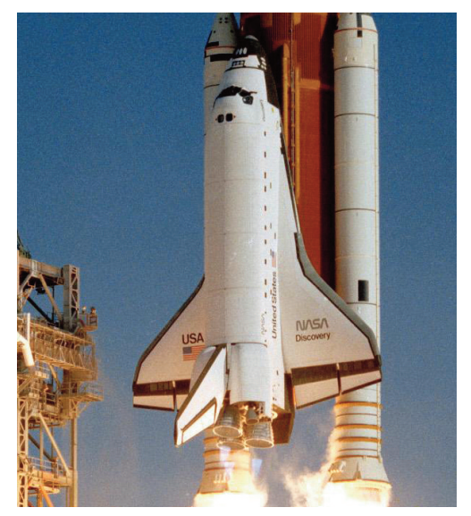
Figure 3: View of the Space Shuttle Discovery showing the 2nd wing configuration (NASA Photo 84PC470, detail).