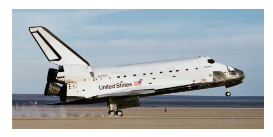
Figure 5: First configuration of insignia on the starboard side of the fuselage. Notice the "reversed" US flag (NASA Photo STSo27-S-o14, detail).

The third and final configuration for the wing insignia was primarily the result of a policy change at NASA. As previously mentioned, the NASA Logotype was not popular among NASA employees. Most employees preferred the NASA Insignia (affectionately nicknamed "The Meatball"), described as having a "dark blue background; solid red wing configuration; white inner elliptical flight path, stars and letters NASA". In 1992, NASA officially retired the logotype and readopted the Insignia for official use. While this change did not result in the immediate repainting of the Space Shuttle orbiters, as they underwent planned renovation work each was repainted with a new configuration of insignia. On the third wing insignia configuration the portside wing displayed only the NASA Insignia, while the starboard wing featured the American flag over the orbiter name (in black). This was the final configuration used in the program. All space-flown shuttles continue to bear this configuration now that they have been retired and converted to museum exhibits, while Enterprise still bears the second configuration. It is important to note that the one element found in all three wing insignia configurations was the American flag, although in the first two versions it was on the left side, while in the third it was on the right.6