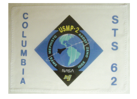
Figure 51: Flag for the United States Microgravity Payload 2 (USMP-2) payload.