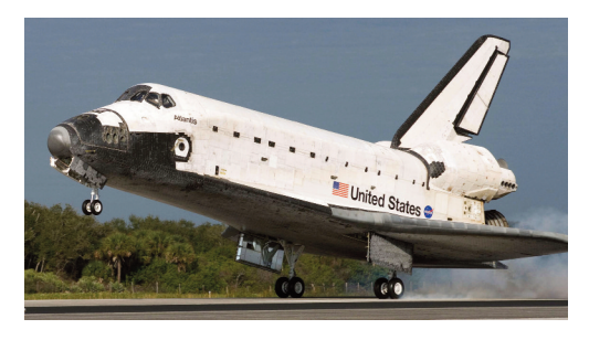
Figure 6: Final configuration of insignia on the port side (top) of the fuselage.