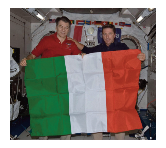
Figure 59: European Space Agency astronauts Paolo Nespoli (left) and Roberto Vittori (right) display their nation's flag as they pose in the Japanese Kibo Lab on the International Space Station (ISS) during the STS-134 mission. The flags of the many nations that have contributed to the ISS Program are displayed in the background.

recognize how the program evolved over time. When the shuttle was first developed, the United States was still engaged in a Cold War with the Soviet Union. Both nations' space programs owed their existence to this competition for international prestige in science and engineering. The prominent display of the United States flag on the wing insignia on the shuttles not only identified the spacecraft as American, but also served as an emblem of national pride. Likewise, the use of the American flag on space suits and as an element in crew mission patch designs served not just as an identification of nationality, but also as an expression of patriotism. Obviously, the "showing of the flag" was not the primary purpose of the American space program, but flags were clearly incorporated into various aspects of the program to demonstrate the continued presence of the United States in the region of Earth's orbit.