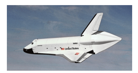
Figure 1: View of the Space Shuttle Enterprise during a test flight showing positions of the US flag on the port side fuselage and wing.

A second wing insignia configuration debuted in 1983 when NASA launched the orbiter Challenger into space for the STS-6 mission. Wing markings in the new configuration consisted of the letters "USA" (in black) over an American flag on the top of the portside wing, and the NASA Logotype (in gray) over the orbiter name (in black). This second configuration was the initial insignia design on Challenger, Discovery, Atlantis, and Endeavour, and the second configuration used on Enterprise. Columbia