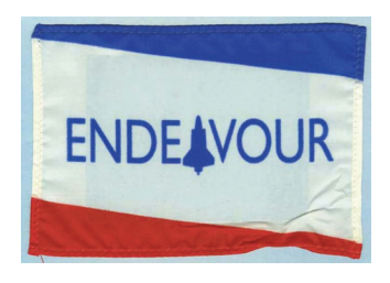
Figure 46: Variant of an orbiter flag (4 x 6 inches) without the Space Flight Awareness logo.

However, since Enterprise was only used for suborbital testing and never reached orbit the silhouette on this flag varies from those for the space-flown orbiters. On the flag for Enterprise, the shuttle image reflects the configuration of the test shuttle during early approach and landing tests – there is a spike on the nose of the orbiter, the payload bay doors remain closed, and there is an aerodynamic cone covering the location where the main engines would be.<sup>16</sup>