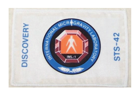
Figure 47: Flag for the International Microgravity Laboratory 1 (IML-1) payload (Image from an eBay auction).