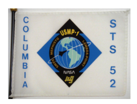
Figure 50: Flag for the United States Microgravity Payload 1 (USMP-1) payload (Image of flag in the collection of the author).