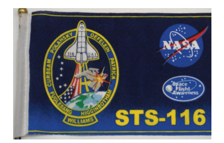
Figure 56: Flag for the STS-116 mission (Image of flag in collection of the author).