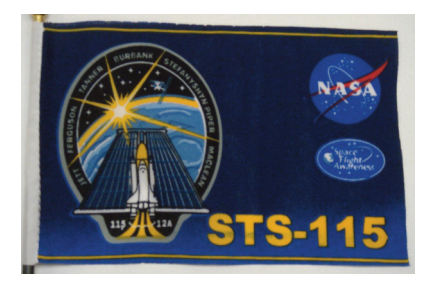
Figure 55: Flag for the STS-115 mission (Image of flag in collection of the author).