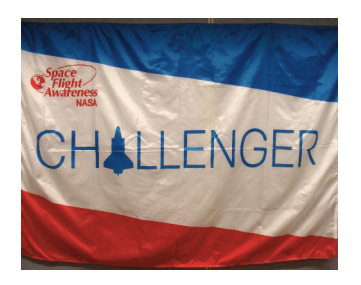
Figure 45: Full-size version of the flag for the Space Shuttle Challenger. Notice that the logo in the upper left-hand corner has been changed to read "Space Flight Awareness".