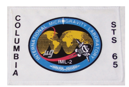
Figure 52: Flag for the International Microgravity Laboratory 2 (IML-2) payload.

the top of the diamond is the payload designation "USMP-1" and at the bottom are the lowercase Greek letter mu and the lowercase Latin letter g. Together the letters µg represent "microgravity". Below the Earth and above the microgravity symbol is the NASA Logotype in white. Surrounding the Earth is a black outline with the words "MEPHISTO", "SAMS", and "LAMBDA-POINT". These were the three experiments that made up the USMP-1 payload: MEPHISTO, an acronym for Matériel Pour L'Etude des Phénomènes Intéressant la Solidification sur et en Orbite (Materials for the Study of Interesting Phenomena of Solidification on Earth and in Orbit); SAMS, the acronym for Space Acceleration Measurement System; and the Lambda-Point experiment. A black Space Shuttle orbiter following a white orbital path is shown overlapping the globe. It is obviously not shown to scale relative to the size of the Earth. Light blue lettering running down the hoist reads "COLUMBIA" and that down the fly reads "STS 52".22