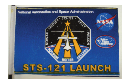
Figure 54: Flag for the launch of STS-121

The final flag that has been found from this period is the flag for STS-116, flown in December 2006. It is similar to the design for STS-115 except that it has the STS-116 mission patch. The lettering for the mission designation is in yellow, matching the