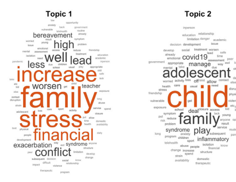
FIGURE S1 Word Clouds for Top 5 Topics in Response to Question "What are you most concerned about in terms of the impacts of the COVID-19 pandemic on health, child development, families, and child and adolescent mental health?"