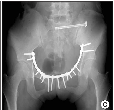
Fig. 1. A 36-year-old female sustained a hemodynamically unstable pelvic ring injury. (A) The plain X-ray shows an anteroposterior compression pelvic injury with transsacral fracture and symphyseal disruption. There was also bilateral superior pubic ramus fracture. (B) Temporary external fixation was performed as a damage control surgery. (C) Definite anterior plate fixation was carried out through a single midline vertical incision.