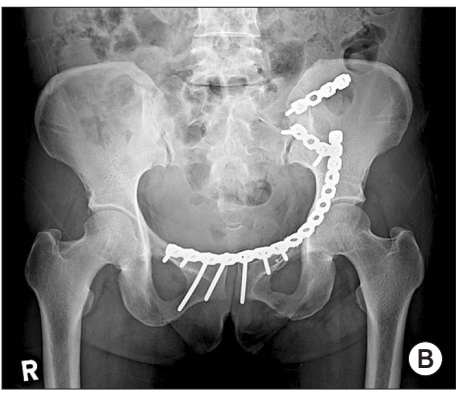
Fig. 4. (A) Unstable pelvic ring injury in a 43- year-old female. (B) Stable anterior ring fixation combined with posterior fixation can increase the stability of the entire pelvis.