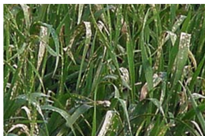
Figure 6. Shark herbicide injury.