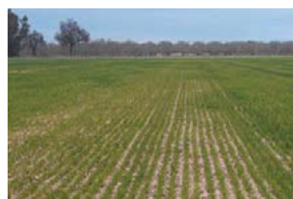
Figure 7. Nitrogen deficiency from denitrification.