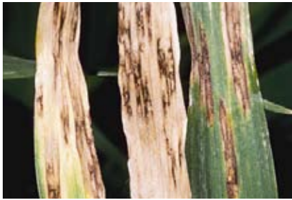
Figure 18. Barley net blotch lesions.