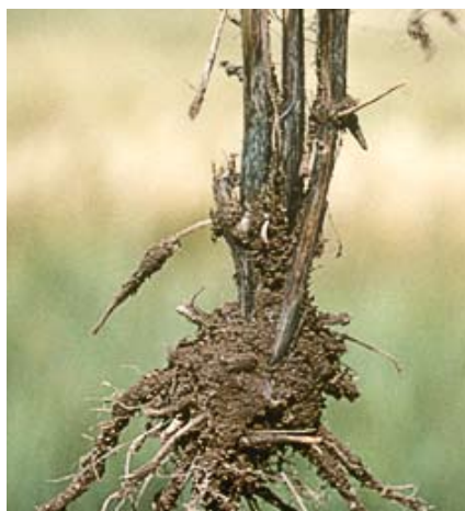
Figure 40. Blackening of stems caused by take-all.