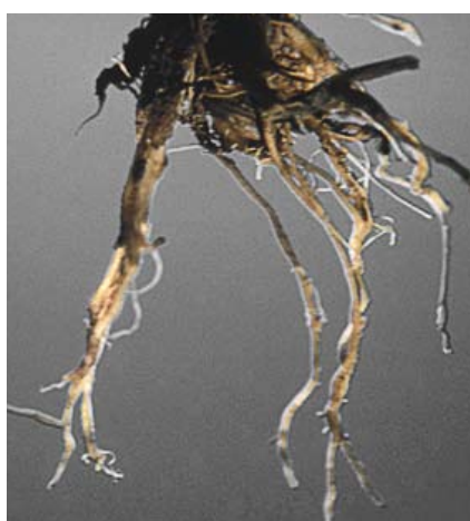
Figure 38. Root rot of wheat.