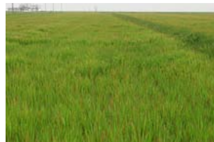
Figure 8. Nitrogen deficiency.