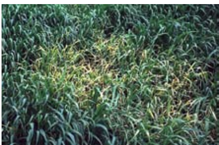
Figure 12. Barley yellow dwarf virus infected area.