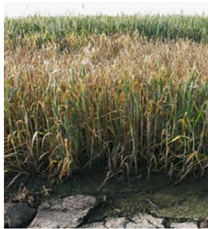
Figure 29. Plant death due to waterlogged soil.