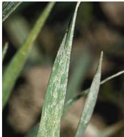
Figure 14. Silvering of leaves due to mite feeding.