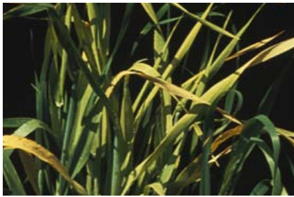
Figure 9. Leaf yellowing of barley from barley yellows dwarf virus.