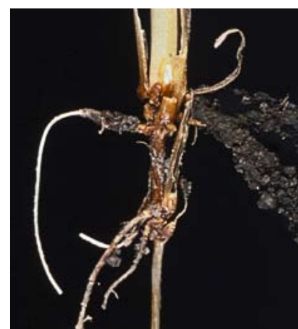
Figure 39. Browning of wheat crown and roots.