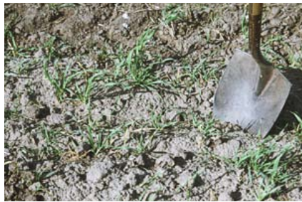
Figure 1. Wireworm damage to barley field.