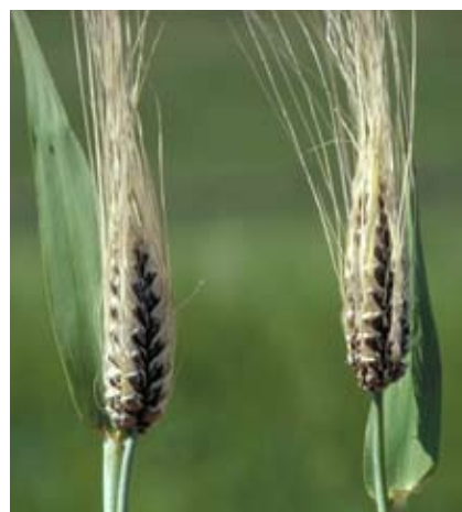
Figure 43. Covered smut of barley.