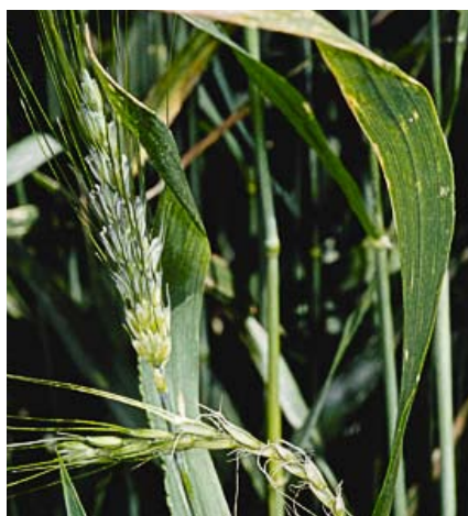
Figure 31. Freezing injury to wheat spike.