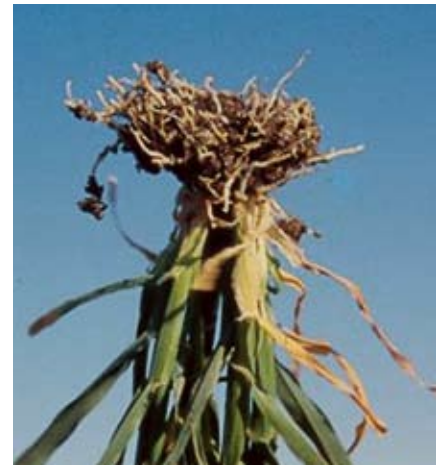
Figure 30. Stunted wheat roots from compacted soil.