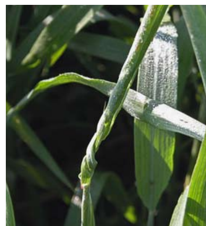
Figure 36. Leaf twisting from phenoxy herbicide injury.