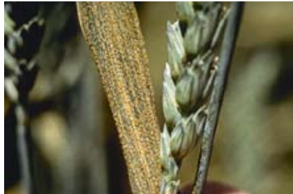
Figure 24. Wheat stripe rust symptoms.