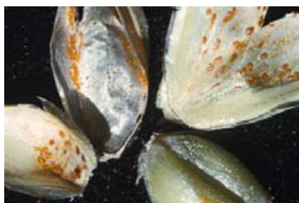
Figure 25. Stripe rust symptoms on wheat kernels.