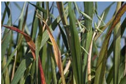
Figure 11. Leaf reddening of oat from barley yellows dwarf virus.