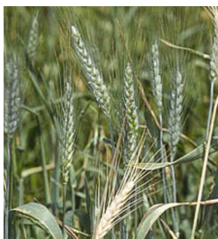
Figure 37. White heads caused by common root rot.