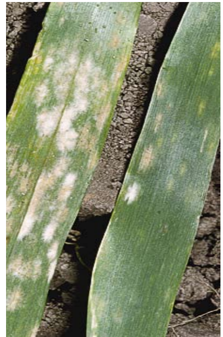
Figure 26. Patches of powdery mildew.