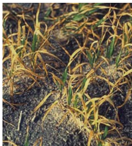
Figure 32. Frost injury to barley seedlings.