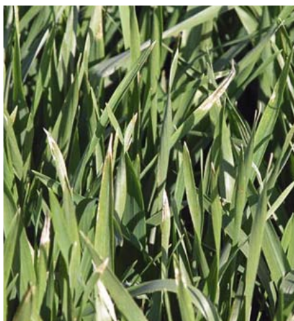
Figure 4. Leaf tip burn from salinity.