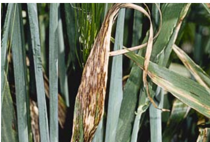
Figure 20. Late symptoms of leaf scald of barley.