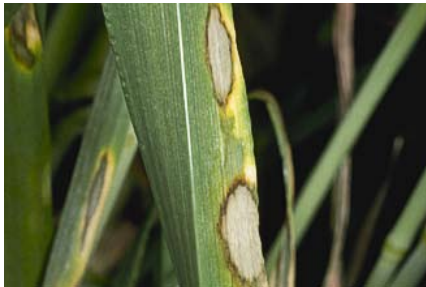
Figure 19. Early symptoms of leaf scald of barley.