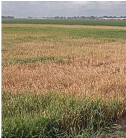
Figure 28. Plants dying due to lagoon water.