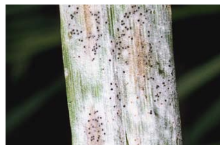
Figure 27. Patches of powdery mildew with cleistothecia.