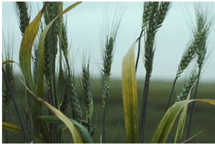
Figure 10. Leaf yellowing of wheat from barley yellows dwarf virus.