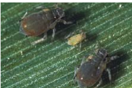
Figure 13. Oat bird cherry aphid.