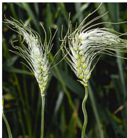
Figure 34. Distorted spikes from phenoxy herbicide injury.