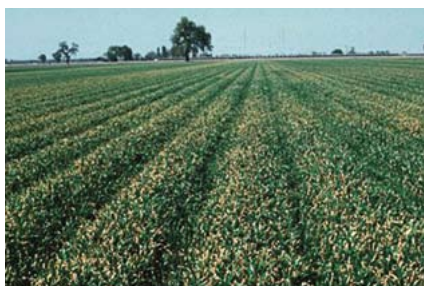
Figure 3. Leaf burn from herbicide injury.