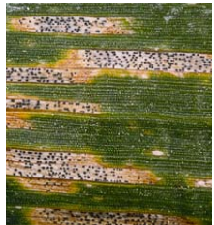
Figure 17. Septoria tritici blotch lesions.