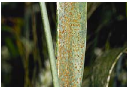
Figure 21. Wheat leaf rust pustules.