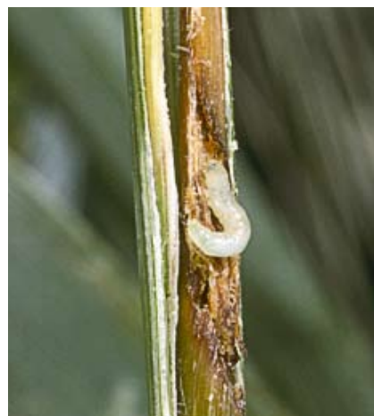
Figure 41. Wheat stem maggot inside stem.