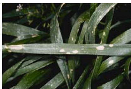
Figure 5. Paraquat spray drift injury.