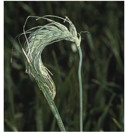
Figure 16. "Hooked spike" from Russian wheat aphid.