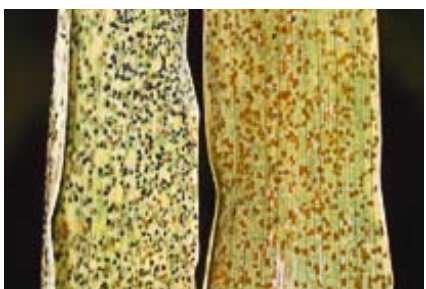
Figure 22. Wheat leaf rust uredial and telial pustules.