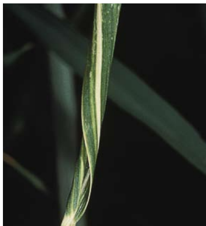
Figure 15. Leaf curling and streaking from Russian wheat aphid.