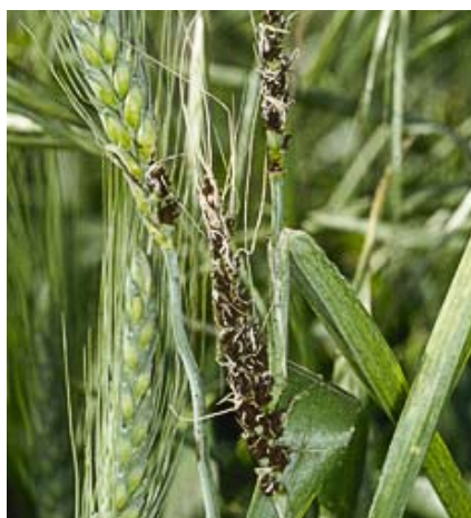
Figure 42. Loose smut of wheat, spike infection.