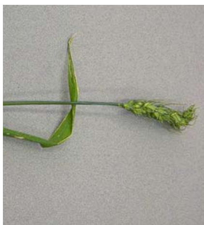
Figure 35. Distorted spike and kinked leaf from phenoxy herbicide injury.