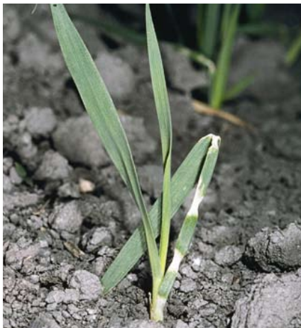
Figure 2. Leaf banding from frost damage.