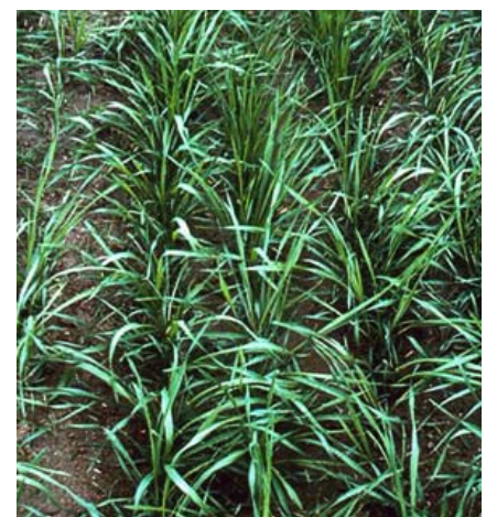
Figure 33. Prostrate growth from Dicamba herbicide injury.