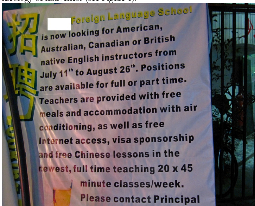
Figure 1: A Recruitment Advertisement on the Street.

Here, the space of Yangshuo, particularly that of West Street, is constructed as an English-speaking place, where authentic interaction with “western travelers” and “foreigners” occurs naturally. It is worth mentioning here that for language schools, native speakers from the inner circle countries (Kachru, 1986) are the preferred teachers (see also Seargeant, 2005), which supposedly helps provide a more authentic learning environment based on the ideology of nativeness (see Figure 1).