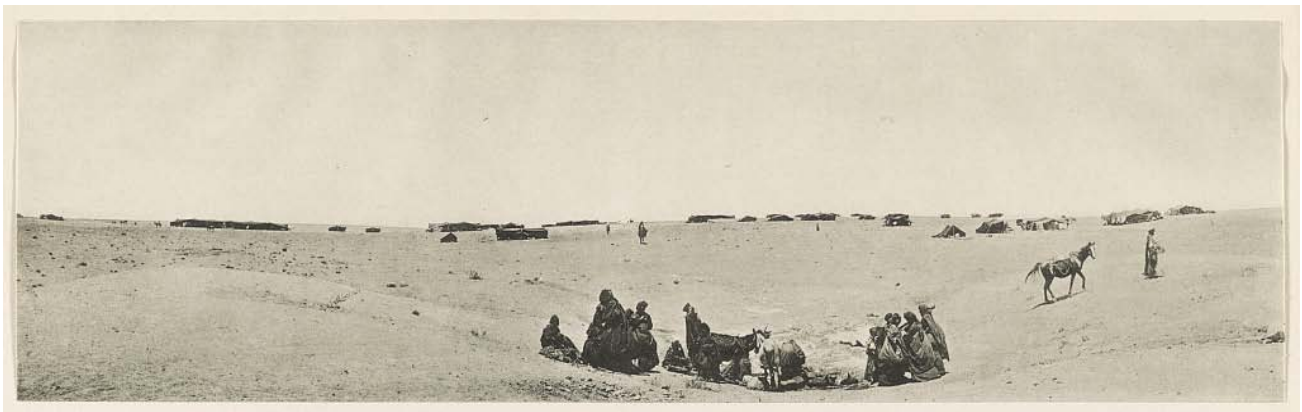
“Ostjordanland Lager der Beni Şachr-Beduinen. 1906. (East Transjordan : Camp of the Banī Şakhr Bedouins. 1906).” Berlin: Dietrich Riemer, 1916. Library of Congress: Miscellaneous Items in High Demand. http://www.loc.gov/pictures/item/2014648733 (accessed May 15, 2015).