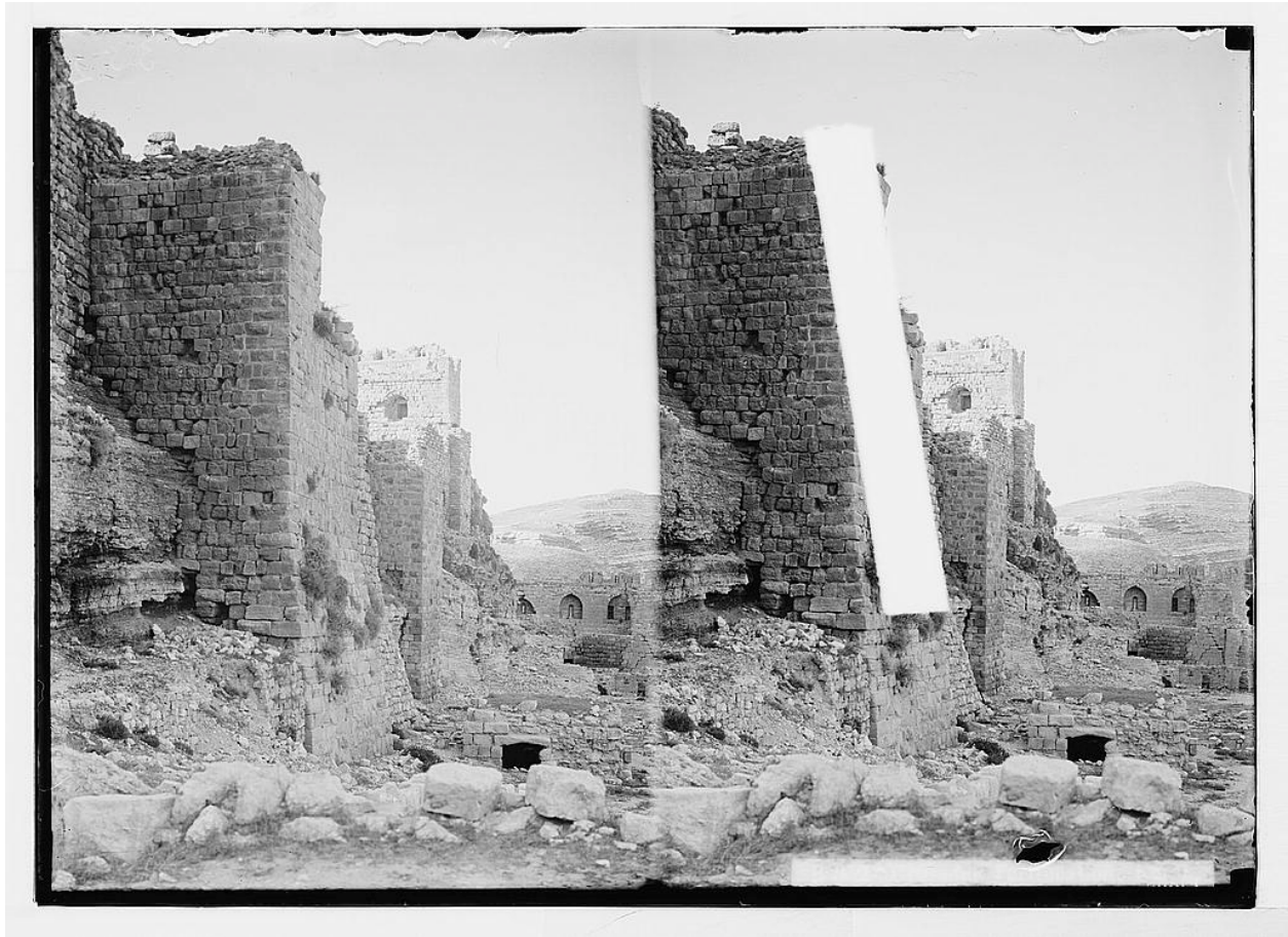
"East of the Jordan and Dead Sea. Crusader fortification, Kerak." Photograph. c. 1900-1920.