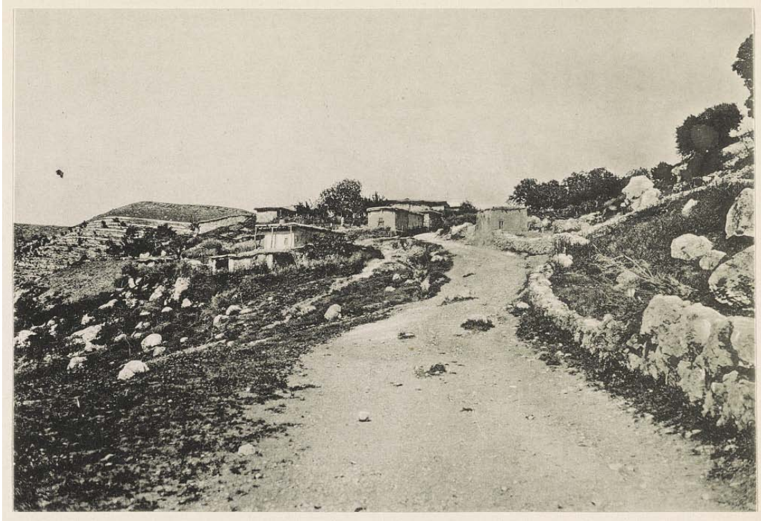
“Ostjordanland Tsherkessenkolonie in Wâdi Şîr. 1905. (East Transjordan: Circassian colony in Wadi al-Sîr. 1905).” Photograph. Berlin: Dietrich Reimer, 1916. From Library of Congress: Miscellaneous Items in High Demand. http://www.loc.gov/pictures/item/2014648724/ (accessed May 15, 2015).