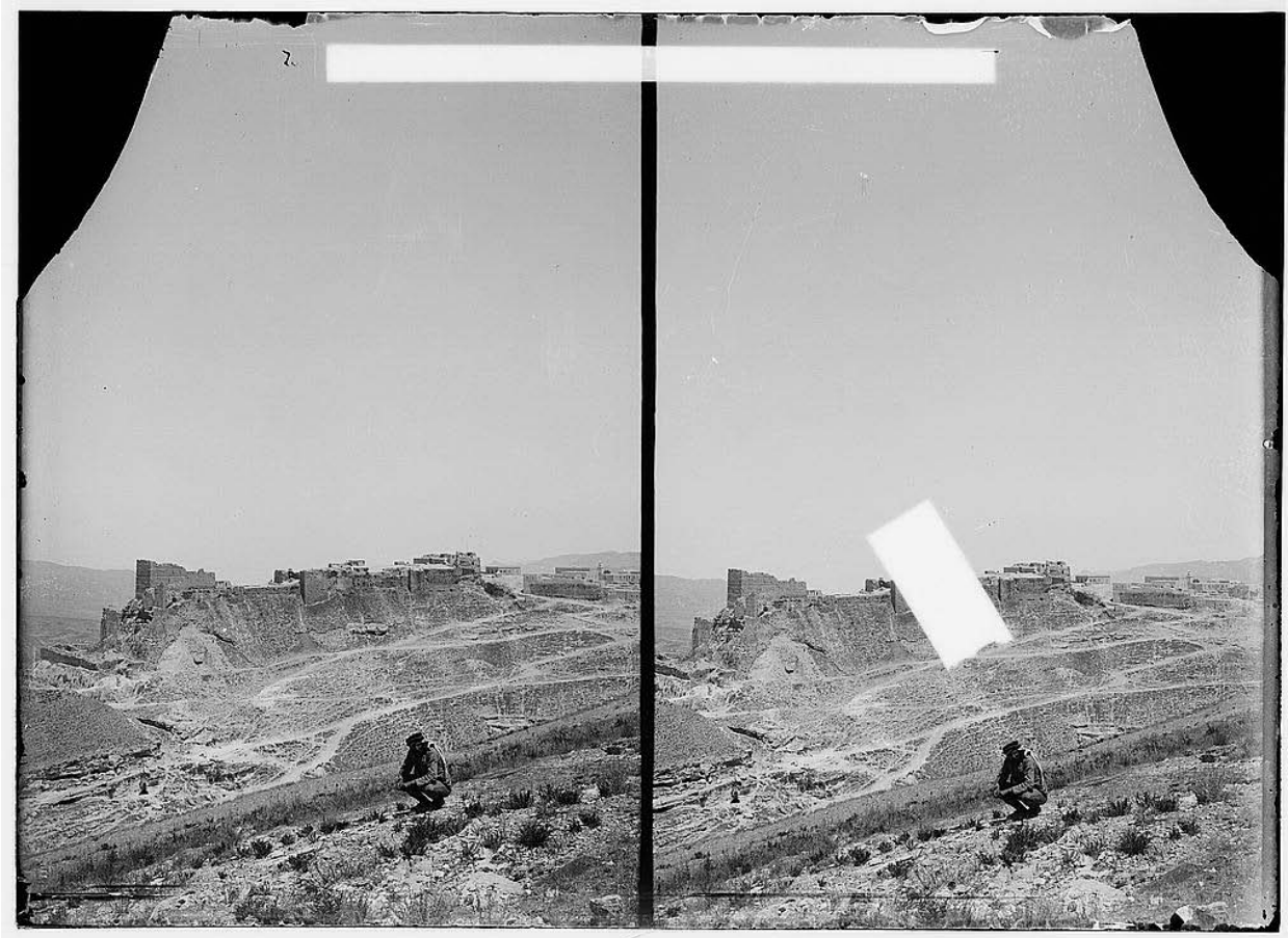
"East of the Jordan and Dead Sea. General view of Kerak (Kir of Moab)." c. 1900-1920. http://www.loc.gov/pictures/item/mpc2004001781/PP (accessed May 15, 2015).