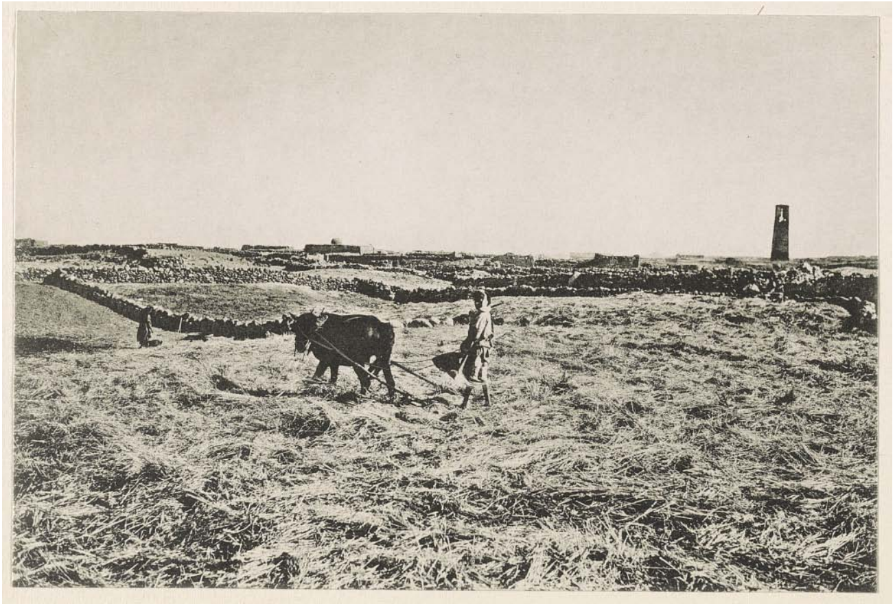
“Der‘âh Getreidedreschen mit dem Dreschschittlitten. 1906. (Dar‘â : Threshing grain with sleds. 1906).” Berlin: Dietrich Reimer, 1916.