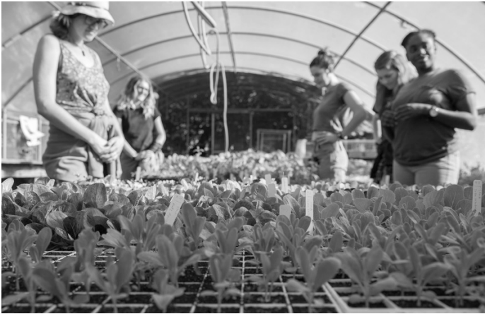
Get a head start on planting by starting seeds indoors in containers.

You can get a head start on planting your crops by starting them indoors in a container to protect them from the elements before weather conditions are optimal. Note that certain plants resist transplanting; root crops, corn, beans, and squash prefer to be planted from seed directly in the ground at the right time of year. Tropical perennials that take longer to mature, such as tomatoes, peppers, and eggplants, need seeds started indoors early to transplant in late spring.