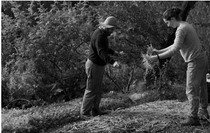
Mulch materials include leaves, wood chips or straw. Hay is not recommended because it contains seeds that can germinate and take over your growing space.

If you live in an area where it's too cold or wet to plant, the next best thing is to cover the soil with a very thick layer of mulch of straw or leaves six to eight inches deep. Your growing space will emerge in spring with improved soil structure that is enriched with organic matter.