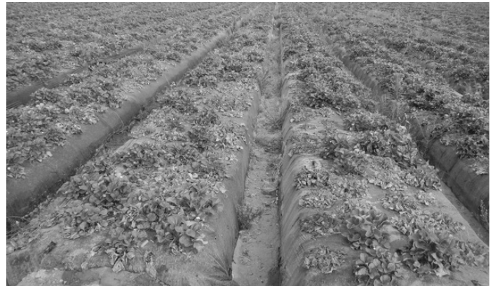
Charcoal rot symptoms can resemble other soilborne diseases so it is essential to identify the pathogen using molecular approaches.

At the end of the three-year study, he plans to share the results at workshops, field days and webinars.