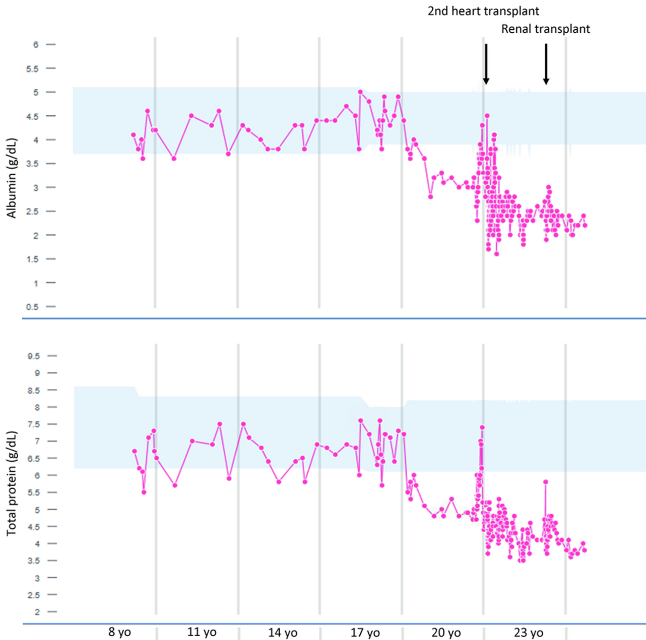
Fig. Serum albumin and total protein levels over time. Pink, albumin or total protein levels. Blue, normal range of albumin or total protein. He received albumin infusion around the second heart transplant and intravenous immunoglobulin (IVIG) infusion around the second heart transplant and the renal transplant. Note the persistent and severe hypoalbuminemia and hypoproteinemia since the age of 18 years other than when he received infusion of albumin or IVIG.

presentation, which normalized renal function; his urine protein examination results remained negative.