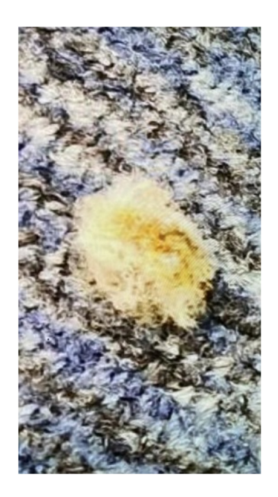
Image 2. Photo from smartphone of an asp caterpillar ( Megalopyge opercularis ) on the carpeted floor of an eyeglass and contact lens store.

Therapeutic management focused on aggressive symptom management. Due to concern for a developing hypersensitivity reaction, dexamethasone 8 milligrams (mg) intravenous (IV), acetaminophen-codeine 300-30 mg per os (PO), famotidine 20 mg IV, ketorolac 30 mg IV, and diphenhydramine 25 mg IV were administered. Upon further inspection of the affected area, several spines were visualized penetrating the patient's skin. Silk tape was applied to the affected area and carefully removed, thus stripping away the