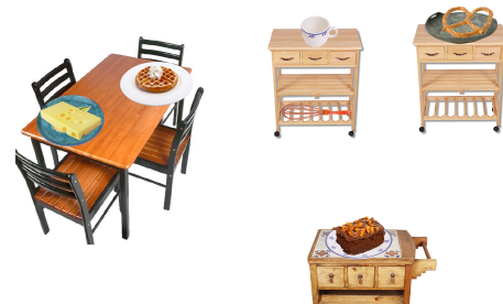
Figure 1: Stimulus for visual world experiment.

The first sentence introduces a situation or topic , such as food in Marc denkt über einen Snack nach . (“Marc fancies a Snack”). The second sentence always identifies a category (e.g., sweet things), matching two of the depicted objects (waffle and cake). Two other objects in the scene belong to another category (the counter category , salty things: cheese and pretzel). The third sentence begins either with a causal ( Daher/Dennoch ) or a concessive ( Deswegen/Trotzdem ) connector (2-level within-participant factor), followed by subject and verb ( holt er sich , “he gets”; connector region). This region precedes another phrase ( aus der Küche , “from the kitchen”; extended connector region), the gender-marked pre-target noun region (e.g., die appetitliche ), and the target noun (causal: Waffel , concessive: Brezel ). Target nouns are always congruent with the preceding discourse. Visuals worlds include the four objects belonging to the category and the counter category and two distractor objects (here, cup and wire whisk), embedded in a simple scene (here, kitchen) .