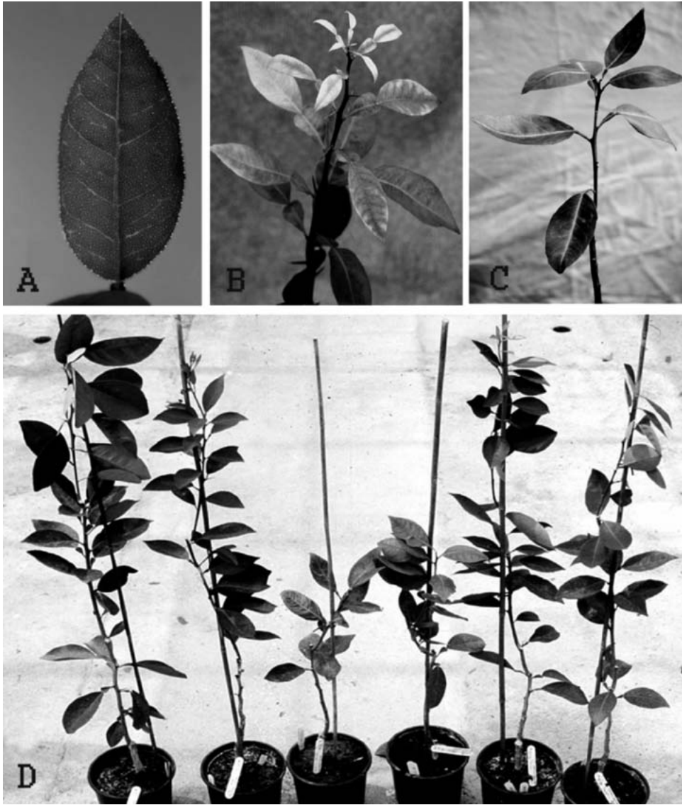
Fig. 1. Typical symptoms of Citrus tristeza virus (CTV) infection in different indicators. A) Vein clearing in Mexican lime. B) Seedling yellows (SY) symptoms in sour orange (note chlorosis and reduction in leaf size). C) Mid-vein chlorosis in leaves of plants of sweet orange grafted on sour orange and infected with a decline-inducing isolate of CTV. D) Different levels of stunting in plants of sweet orange grafted on sour orange six mo after inoculation with five different isolates of Citrus tristeza virus (CTV). Uninoculated control is at right.

ingly, SP in the sweet orange scion was frequently observed in plants infected with isolates that induced marked SP in MV seedlings. In some cases, this SP may also have contributed to the stunting observed in the sweet/sour plants.