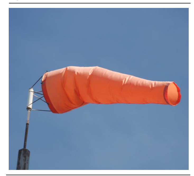
Figure 3. Windsock9

A conically shaped segmented tube devised to measure the speed and direction of wind gave its name to a characteristic radiologic appearance of intraluminal duodenal diverticulum formed by passive elongation of congenital duodenal web due to peristalsis.