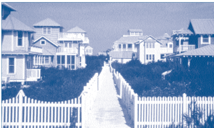
Picket fences and front porches mark Seaside, Florida

Empirical studies, in contrast, can’t assume away behavior. They must explain it. The research strategy in most empirical analyses is to search for correlations among neighborhood features and observed travel—sometimes controlling for other relevant factors, sometimes not. Even then, Susan Handy and others report that outcomes are