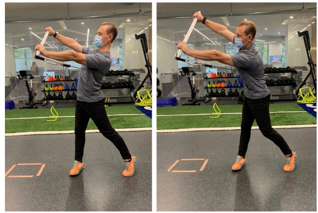
Figure 9: Kinetic change breakdown: (a) poor kinetic chain linking with an upward cable lift; notice the rib flare and increased low back lordosis, (b) proper kinetic linking with stable core to dissipate force throughout the kinetic chain

The main goals of this phase are to regain high levels of proprioception, neuromuscular control, strength, and fitness with the intent to return to previous levels of athletic activity. 80 The overall goal for any athlete is to not only to return to their sport, but to return to their sport at the highest level possible. As activity is increased during this phase to include progressive plyometric activity and agility training, caution should still be taken on potentially overloading of the patellofemoral joint with increased activity. 82 Athletes need to continue to be diligent with their lower extremity strength gains in this phase allowing for proper support of their knee joint with higher level activities. An advanced