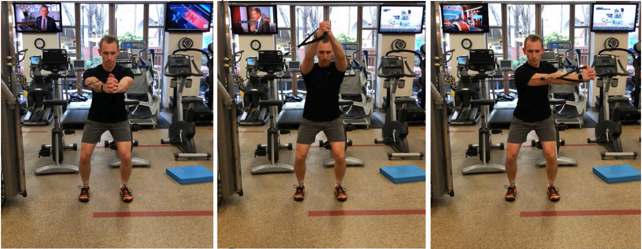
Figure 7: Pallof Press variation: (a) frontal plane (core activation), (b) sagittal plane (core strength), (c) transverse plane (rotational stability)

ple visual assessment of movement patterns to biomechanical analysis using a motion capture system. Although the joint is structurally repaired at this point and pain continues to improve, athletes may have developed altered movement patterns that became ingrained in their neuromuscular system. These discrepancies can continue to be present unless they are observed in a qualitative and quantitative manner and corrected previously during the rehabilitation process. A movement assessment for the athlete can help identify weaknesses in the kinetic chain, and aid in the development of a global plan to allow the athlete for a more efficient return to their sport. 58