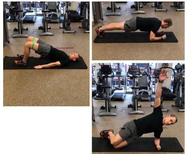
Figure 3: Preliminary Kinetic linking: (a) DL bridge with band abduction, (b) front plank, (c) modified side plank

This next transition phase of rehabilitation focuses on progressive strengthening, and typically lasts until 12 weeks post-operatively. 54-57 Strengthening in this phase should transition to exercises that progressively load the knee joint. Careful consideration must be taken in this phase of rehabilitation as the athlete resumes most activities of daily living. Most athletes with osteochondral defects have experienced chronic pain associated with their lesions, as it is a common occurrence for this patient population to delay receiving definitive treatment. Because of this, the aspect of pain had been prevalent in their everyday activities before, and thus the idea of “some pain is normal” continues to be in their mindset. In this phase of rehabilitation, the athletes’ pain continues to dissipate, and they may want to return to their sport sooner than recommended. Proper education should be addressed with the athlete, placing an emphasis on the biologic healing required to take place in conjunction with progressive strengthening and conditioning necessary for a proper and safe progression. Multiplanar gluteus and hip strengthening should be introduced at this phase as weight bearing precautions and protocol allows. Examples of exercises emphasizing these muscles groups include standing hip clocks with band resistance, and lateral or monster walks. (Figure 4) Constant cues should be given to athletes regarding proper loading and proper joint