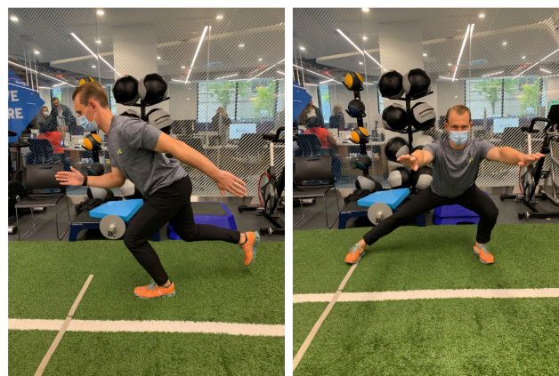
Figure 6: Proper hip hinge pattern to decrease pressure on knee joint (a) single leg RDL, (b) side lunge/Cossack squat

Continuing to develop kinetic chain linking procedures