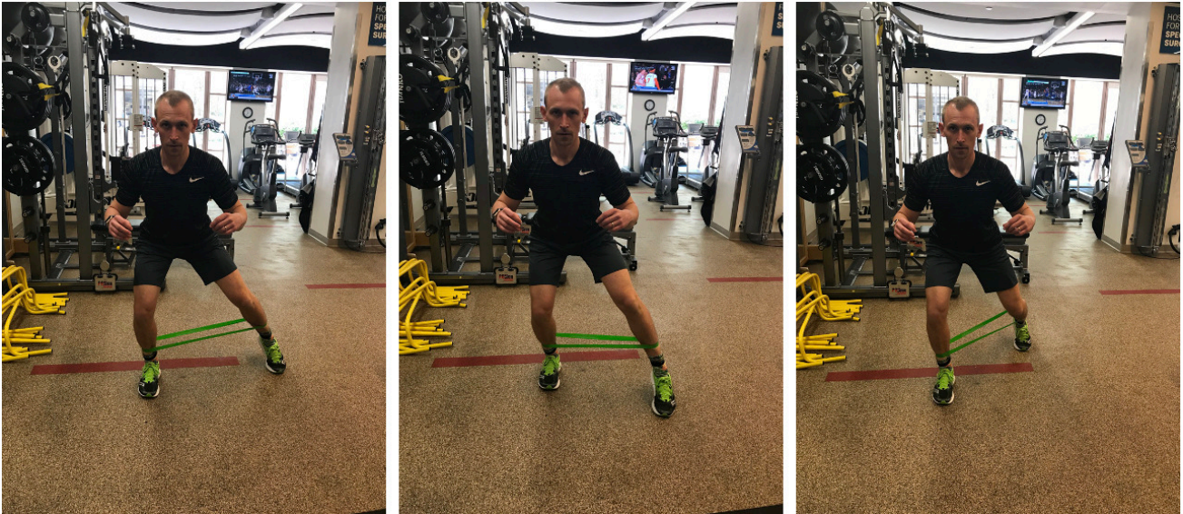
Figure 4: Standing hip clocks with band resistance