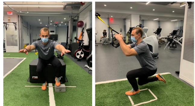
Figure 8: Single leg squat progressions (a) block underneath foot to decreased weight bearing on that side, (b) Suspension system assisted single leg squat

progressed well to this point, they should continue to monitor the overall load on their knee to prevent any persistent effusion or pain.