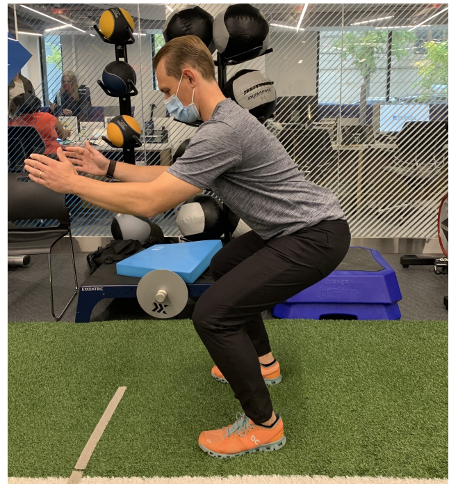
Figure 5: Proper hip hinge pattern for double leg squat

Full ROM should be attained in this phase through continued use of the stationary bike along with hip flexor and quadriceps stretching. The athlete should be encouraged to stretch and mobilize often throughout the day to avoid forceful manipulation of the knee joint and subsequent