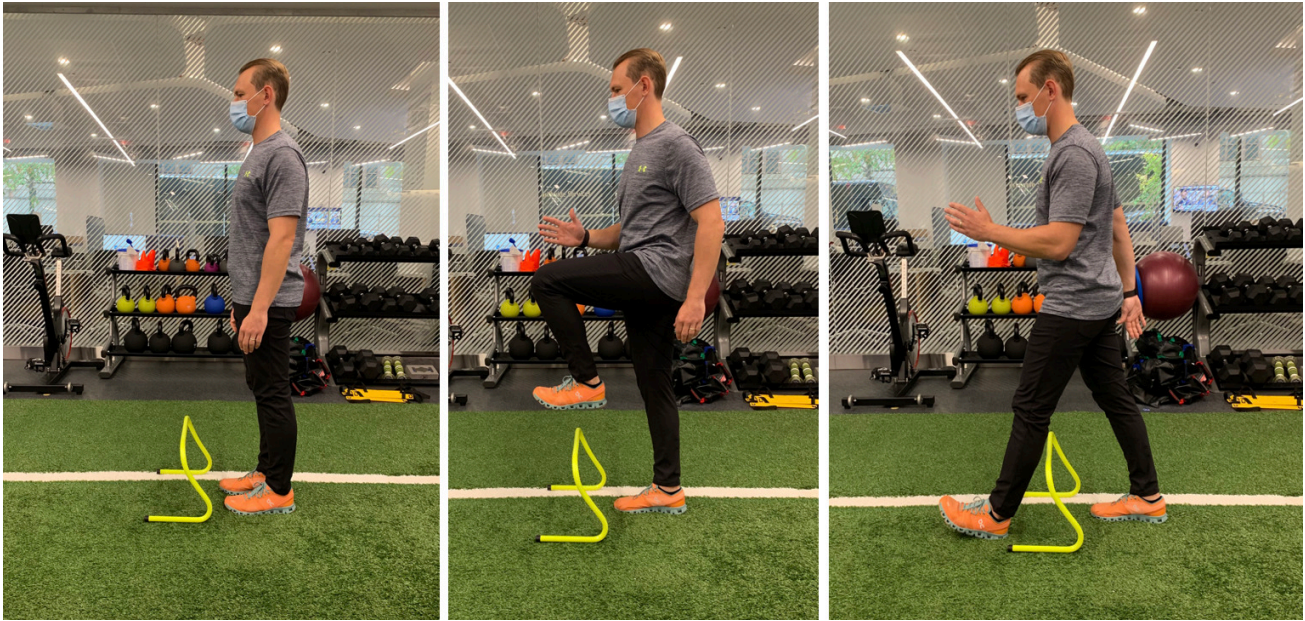
Figure 2: Single hurdle step over to aid with proper gait: (a) starting position, (b) Maximal knee flexion with opposite arm flexion, (c) ending position of heel strike and quad contraction

hab process, it is valuable for the athlete to participate in some modification of their sport to remain connected in a positive way. Having a basketball player perform seated ball handling and shooting activities or having a tennis player perform seated forehand shots can allow for a smooth transition back to in game mechanics. Initiating such activities such in this stage can help them on their mental journey of returning to sport.