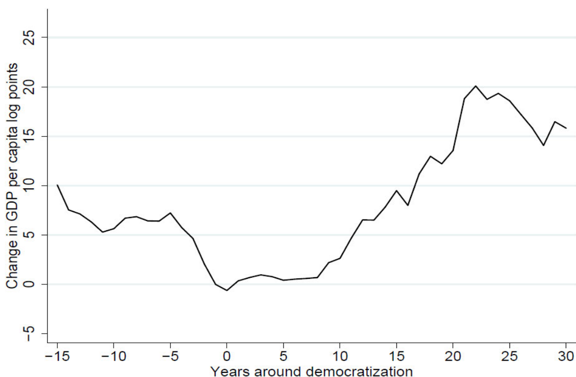
Figure 2: GDP per capita around a democratization.

arguments for causality have been made in both directions. Lipset (1959) famously offered his “modernization” hypothesis according to which rising levels of income would lead to democratization. More recently, Acemoglu et al. (2015) have argued that democratization leads to growth. Figure 2 shows the association estimated in their paper on the evolution of GDP per capita around democratization events.