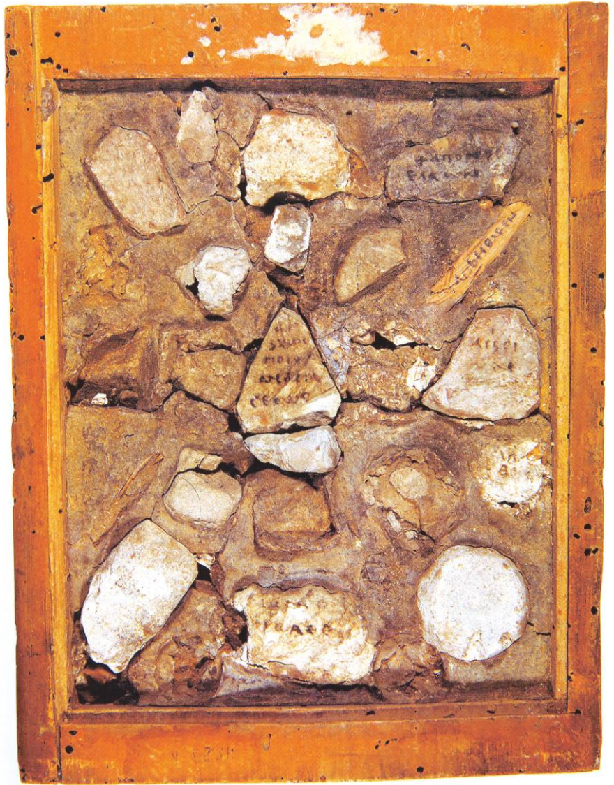
Fig. 3 Vatican casket, contents: a hardened mass of yellow sand containing stones and fragments of wood, some of them with inscriptions.

parallels are the basis for the most common dating of the casket to the late sixth or early seventh century. 20