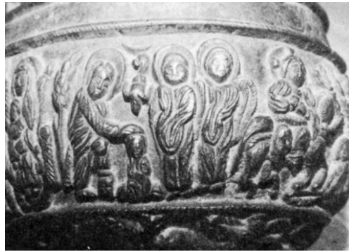
Fig. 4 Bronze censer from Palestine, ca. 600.

Comparing the iconography of the scene that includes Christ's baptism with further parallel scenes, beyond the Rabbula Gospels, reveals another unique detail. 44 Starting in the sixth century, bronze censers from Syria or Palestine, ivory plaques, and pilgrim ampullae bore a combination of several narrative scenes from the life of Christ, which later went on to become a trend in the iconography of Christian art. 45 On the lid of the Vatican casket, Christ is accompanied not only by John and two angels but also by two other saints. These two figures probably represent two of John's disciples who joined Jesus (only mentioned in John 1:35–37 and not in any of the other gospels). The two angels can be found in other places as well, including on the Syrian bronze censer today preserved in Baghdad (fig. 4). 46 Several of these examples also show a river god, and one of them adds Sol and Luna, a reference to the fact that both are visible at the same time, as mentioned in liturgical texts. Most, however, show only John, Christ, and at most one angel. None other shows two saints and two angels, as the Vatican casket does. 47