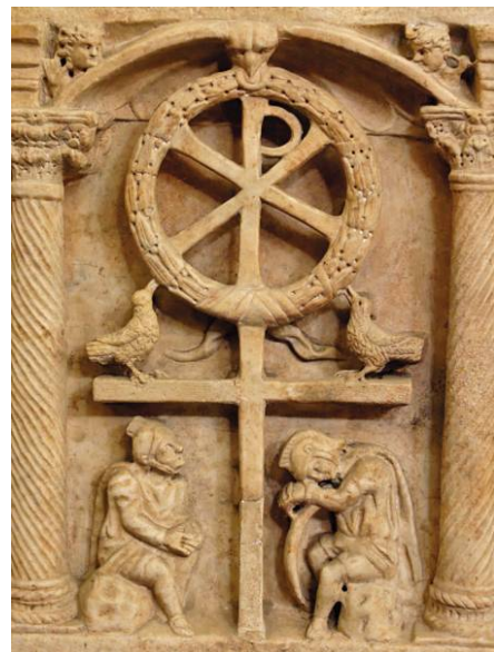
Fig. 6 Anastasis, symbolic representation of the resurrection of Christ. Panel from a lidless Roman sarcophagus of the "Passion type," ca. 350. From the excavations of the Duchess of Chablais at Tor Marancia, 1817–21; Museo Pio Cristiano, Vatican.

As we continue to consider the empty cross and the absence of Christ, let us return to the inscribed viewer. The suggestion of an inscribed viewer leads to the difficult question of how the Vatican casket was used and how ways of experiencing it were different from reading an illuminated gospel or visiting the actual sacred sites in the Holy Land. The first view of the box provides the beholder with a type of vision fundamentally different from the experience of a pilgrim in the Holy Land. Furthermore, the beholder who then opens the box and looks inside, following the scenes in the order of the historical events, moves along horizontal and vertical lines: the field is divided as though by two overlapping wooden beams forming a cross, and the way the linear narrative