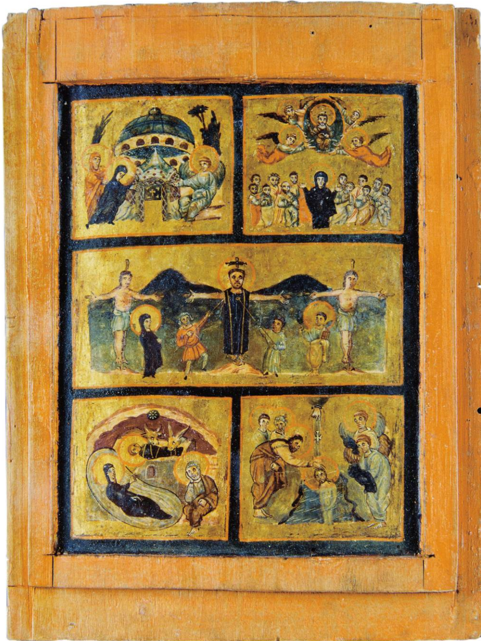
Fig. 2 Vatican casket, interior lid.