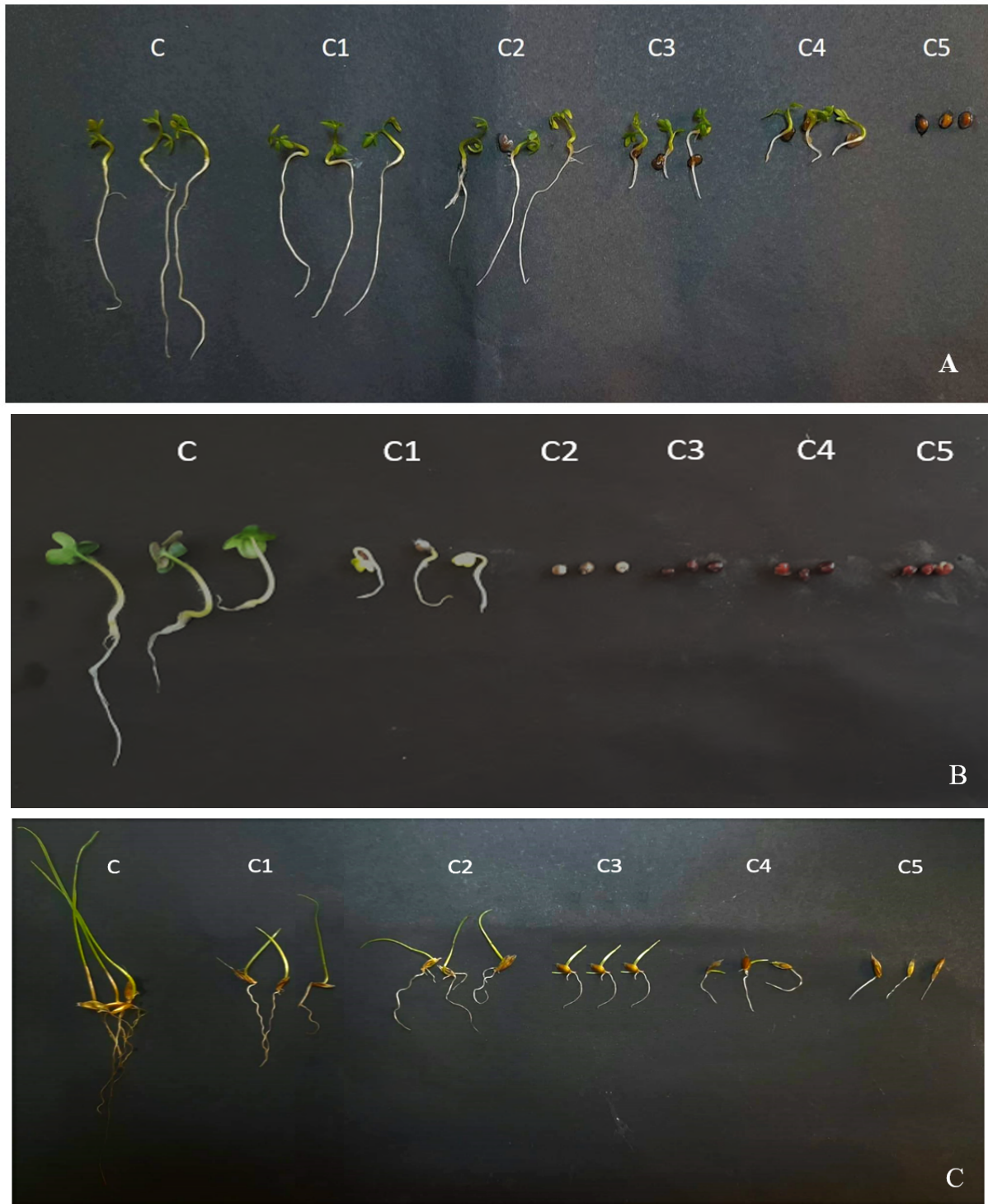
Figure 2. Phytotoxic effects of the EOs on L. sativum L. (A), S. arvensis L. (B) and L. rigidum Gaudich. (C). C: 0 \mu\text{L}/\text{mL} ; C1: 1 \mu\text{L}/\text{mL} ; C2: 2 \mu\text{L}/\text{mL} ; C3: 3 \mu\text{L}/\text{mL} ; C4: 4 \mu\text{L}/\text{mL} ; C5: 5 \mu\text{L}/\text{mL} .

All EOs strongly reduced the germination and seedling growth of the tested plants. Varying degrees of inhibition were observed depending on the EO, the concentrations and the response of the species, as shown in Figure 2.