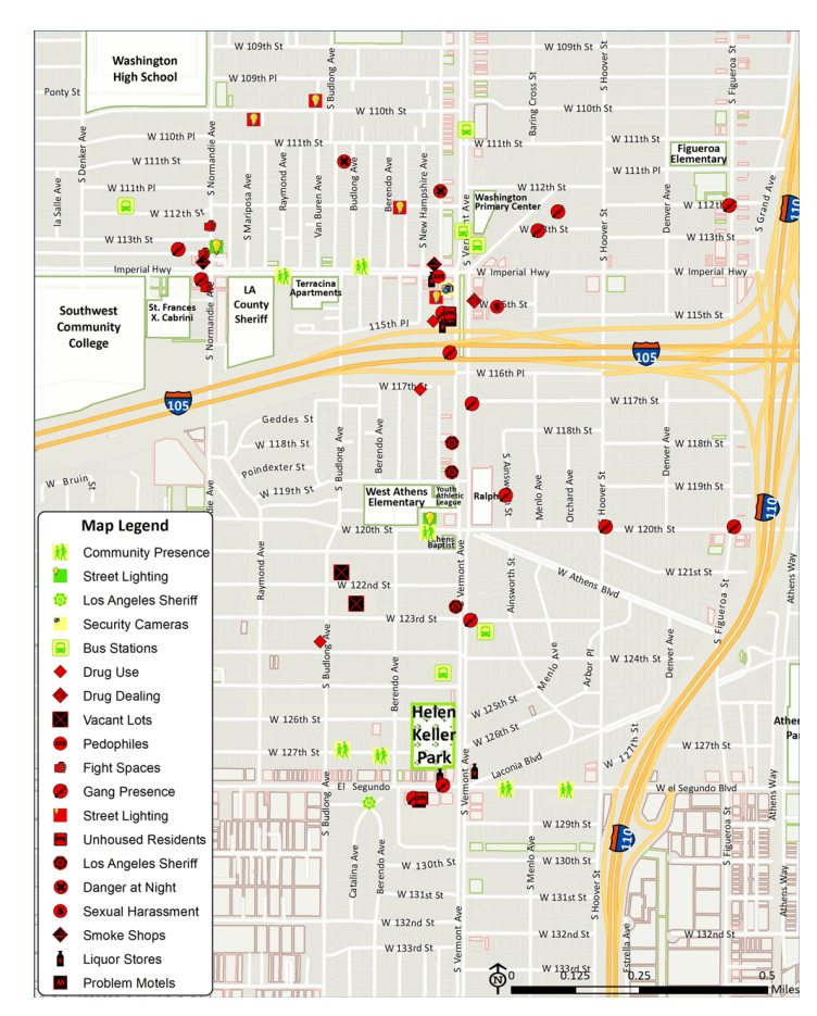
Figure 2. Digitized participatory geographic information systems map of community park access assets and challenges, South Los Angeles, 2015.

PUBLIC HEALTH RESEARCH, PRACTICE, AND POLICY