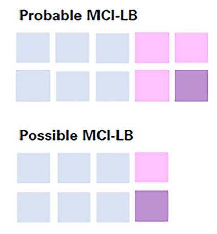
Fig. 2 Probable and possible mild cognitive impairment with Lewy bodies (MCI-LB). In addition to the presence of all three essential criteria (blue), two core features (pink), or one core feature and one positive proposed biomarker (purple), are required for a diagnosis of MCI-LB. The presence of either a positive biomarker or core feature in addition to all three essential criteria is suggestive of possible MCI-LB [7]

People with MCI who progress to DLB demonstrate a higher frequency of parkinsonism, fluctuating cognition, and RBD compared to those who progress to AD [10, 11].