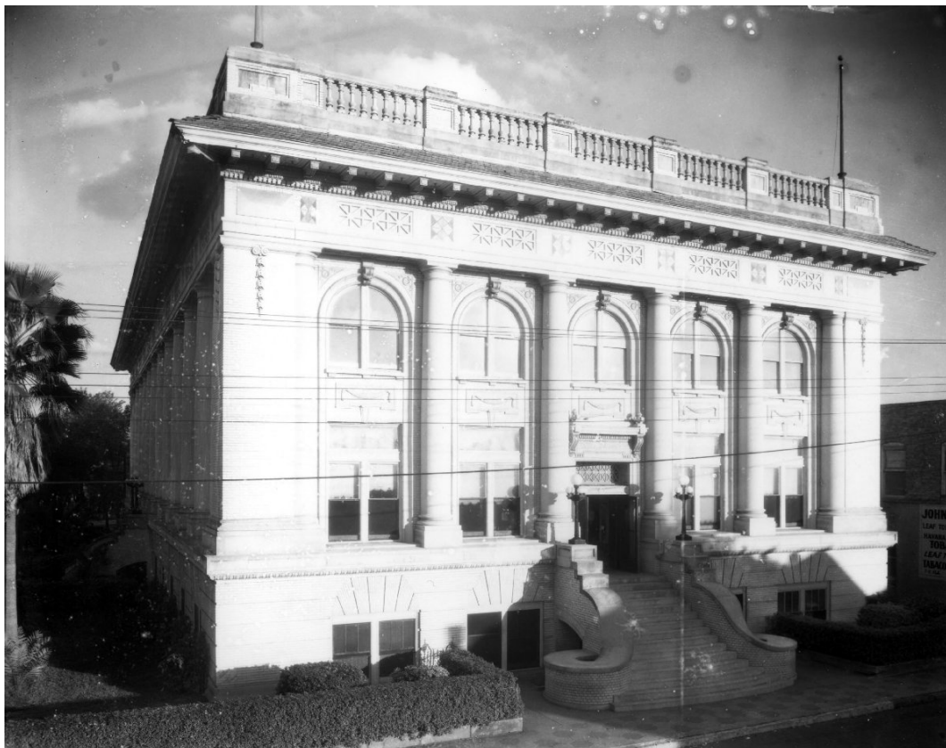
Centro Asturiano building at 1913 Nebraska Ave. in Ybor City (Tampa), Florida.

nineteenth century. Thus was created the Spanish-language, Tampa Federal Theatre Project, the nation's only Spanish-language unit, right in Ybor City. 14 Most of the Project's performances were held in the theatre at Ybor City's Centro Asturiano club.