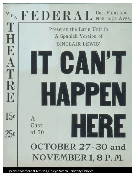
Cover of English-language playbill for the Latin unit's, Spanish-language version of Sinclair Lewis's "It Can't Happen Here."