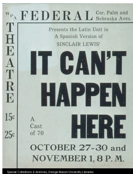
Cover of English-language playbill for the Latin unit's, Spanish-language version of Sinclair Lewis's "It Can't Happen Here."