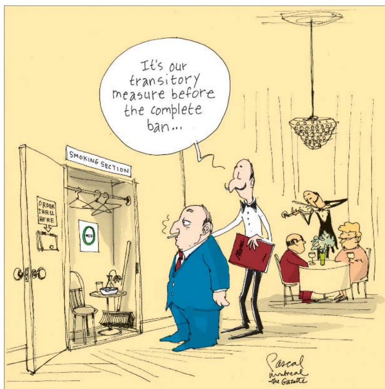
The Health Minister of Quebec announces plans to improve the Canadian province's Tobacco Act, eliminating all smoking from restaurants, bars, and other places inadequately covered by the existing law. © Pascal 2005.