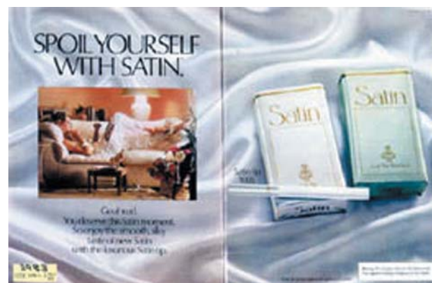
Figure 1 In this 1983 Satin “Couch” advertisement, the caption reads, “Go ahead. You deserve this Satin moment. So enjoy the smooth, silky taste of new Satin with the luxurious Satin tip”. With the Satin brand and advertising campaigns, Lorillard attempted to capture a sensuous image of highly feminine—not feminist—women. This campaign was designed to communicate a self indulgent, relaxing, escapist fantasy for mature, busy women, whether employed or not, who felt pressured by many demands on their time.

The 1982 Satin marketing strategy was “to convince the target that only Satin can pamper and gratify her special feminine needs and moods when it comes to smoking