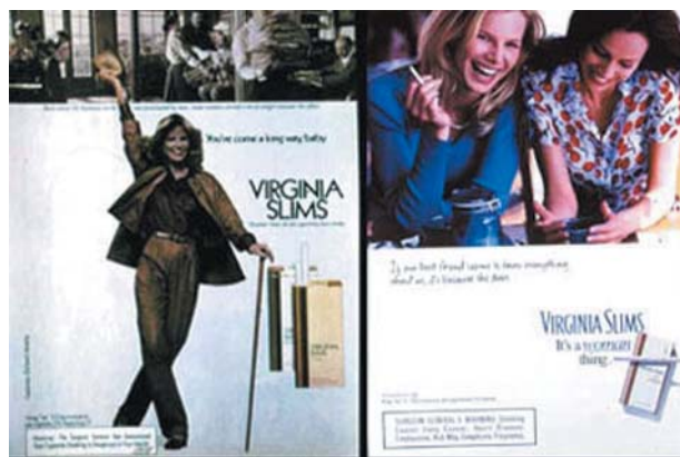
Figure 5 The left image is from the Virginia Slims "You've Come a Long Way, Baby" campaign in 1978; the right is from the "It's a Woman Thing" campaign in 1997. Virginia Slims' core user group was aging, and by the mid 1990s the feminist appeal of the long running "You've Come a Long Way, Baby" campaign was not well received by many younger women. PM recreated the Virginia Slims image by downplaying feminism and emphasising gender stereotyped female relationships. The caption of the right image reads, "If our best friend seems to know everything about us it's because she does. Virginia Slims. It's a woman thing".

Stereotypical gender differences and a return to the traditional war of the sexes may act as a means of carving out the exclusive in-group to which women belong. Respondents in Marketing Perceptions' research said, "Women build really close friendships. Men don't seem to ever be as close... Guys go out to lunch to eat. Women go to chat". 41 Similar statements are featured in Leo Burnett's