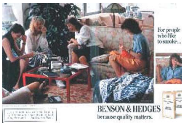
Figure 2 With the 1986 Benson & Hedges "For People Who Like to Smoke" campaign "Living Room Girls" execution, PM attempted to combat the declining social acceptability of smoking through brand image. "For People Who Like to Smoke" depicted casual, jovial scenes of upper middle class people enjoying meaningful time with friends and family, where conflict between smokers and non-smokers was entirely absent.

The tagline "For people who like to smoke" implied to the respondents a sense of sharing: "we're allies as smokers", "it