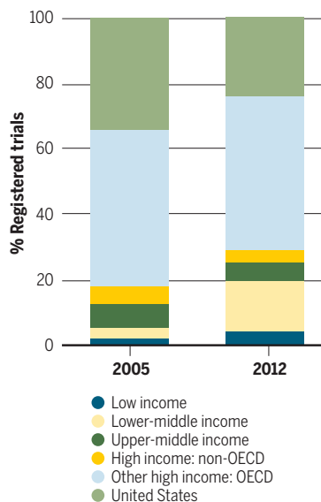
Fig. 2. Percentage of registered clinical trials worldwide. Shown is the percentage of registered clinical trials worldwide in 2005 (left) and 2012 (right) for countries grouped according to income by the Organisation for Economic Cooperation and Development (OECD) (31). From 2005 to 2012, the proportion of registered clinical trials in low-income (dark blue) and lower-middle-income (pale yellow) countries increased; the proportion of clinical trials in upper-middle-income countries (dark green), high-income countries (bright yellow), and the United States (pale green) decreased; and the proportion of clinical trials in other high-income countries (pale blue) remained almost the same. Data were extracted from Drain et al. (31).

Since the publication of ICH E5(R1) and E17, scientific advances have accelerated the discovery, development, evaluation, and approval of medical products. These advances have refined our understanding of both the intrinsic and extrinsic factors that govern drug disposition, toxicity, and response. Simultaneously, clinical trial infrastructure and methodologies have evolved, and recently, the fraction of registered clinical trials conducted in low- and middle-income countries has increased (Fig. 2) (31). This trend, plus inclusion of populations with diverse ancestral backgrounds within individual countries, has increased the representation of different ethnic groups in clinical trials, reducing the need to conduct in-country trials based on intrinsic factors. However, representation of different ethnic groups in clinical trials must be sufficient, and clinical studies need to be appropriately powered to understand the effect of intrinsic factors on the response to and toxicity of the drug under investigation.